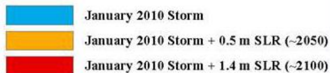
Figure 11. Example of analysis of SLR impacts. Flooding hazards predicted from the CoSMoS hindcast of the January 2010 storm, with and without sea level rise (SLR) scenarios, in the region of Venice and Marina del Rey, CA.