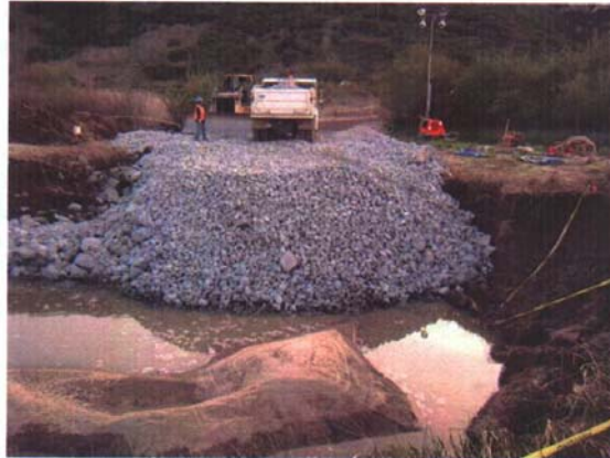
Photo 5. The repair area and temporary access construction as of Thursday evening. Much of the rock will be used to create a stable platform for the new pipe segment, and the remainder will be removed before site restoration.