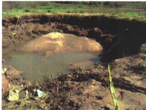
Photo 2. The sediment and "calved" salt marsh soil and plants around the perimeter of the wash-out hole will be salvaged for onsite restoration.