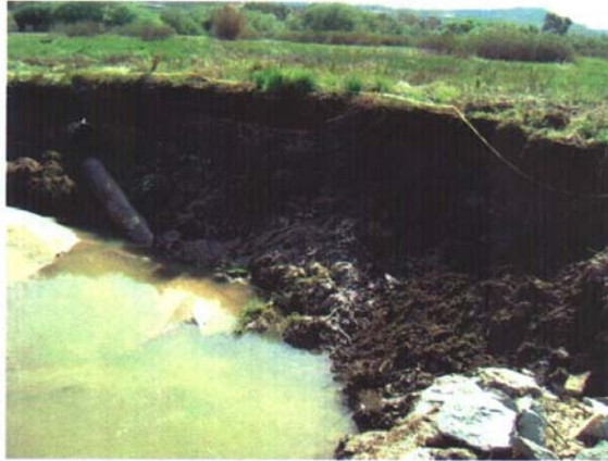
Photo 1. The water main break in brackish marsh, showing the exposed ends of the pipe break. The resulting wash-out hole is approximately 12 feet deep and over 50 feet in diameter.