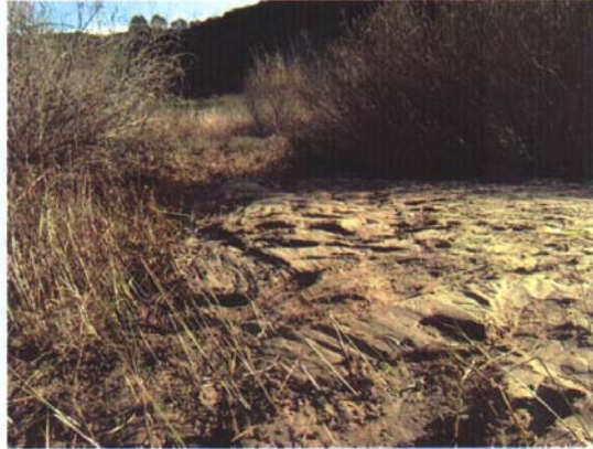
Photo 3. A portion of the sediment plume in a mosaic of brackish marsh and mule fat immediately east of the pipe break and wash-out area.