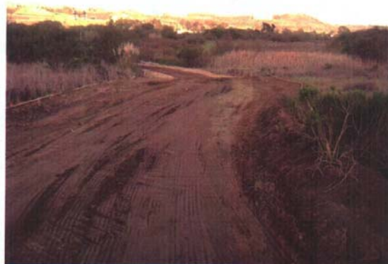
Photo 6. The impacted coastal sage scrub area for the temporary access road and material staging. Much of this area would be classified as disturbed coastal sage scrub dominated by non-native plants.