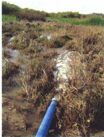
Photo 4. Water from the wash-out hole was being pumped out and deposited approximately 200 feet west within brackish marsh habitat. The pumps were removed from the site on Thursday afternoon.