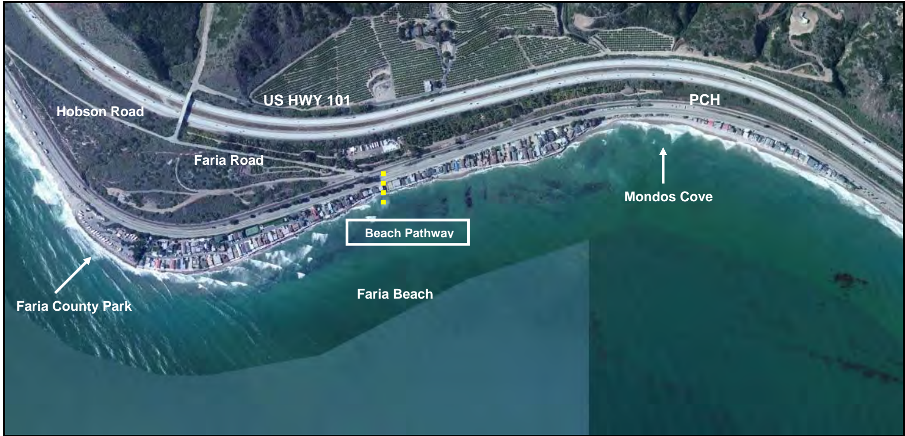
EXHIBIT 2 Aerial Photomap