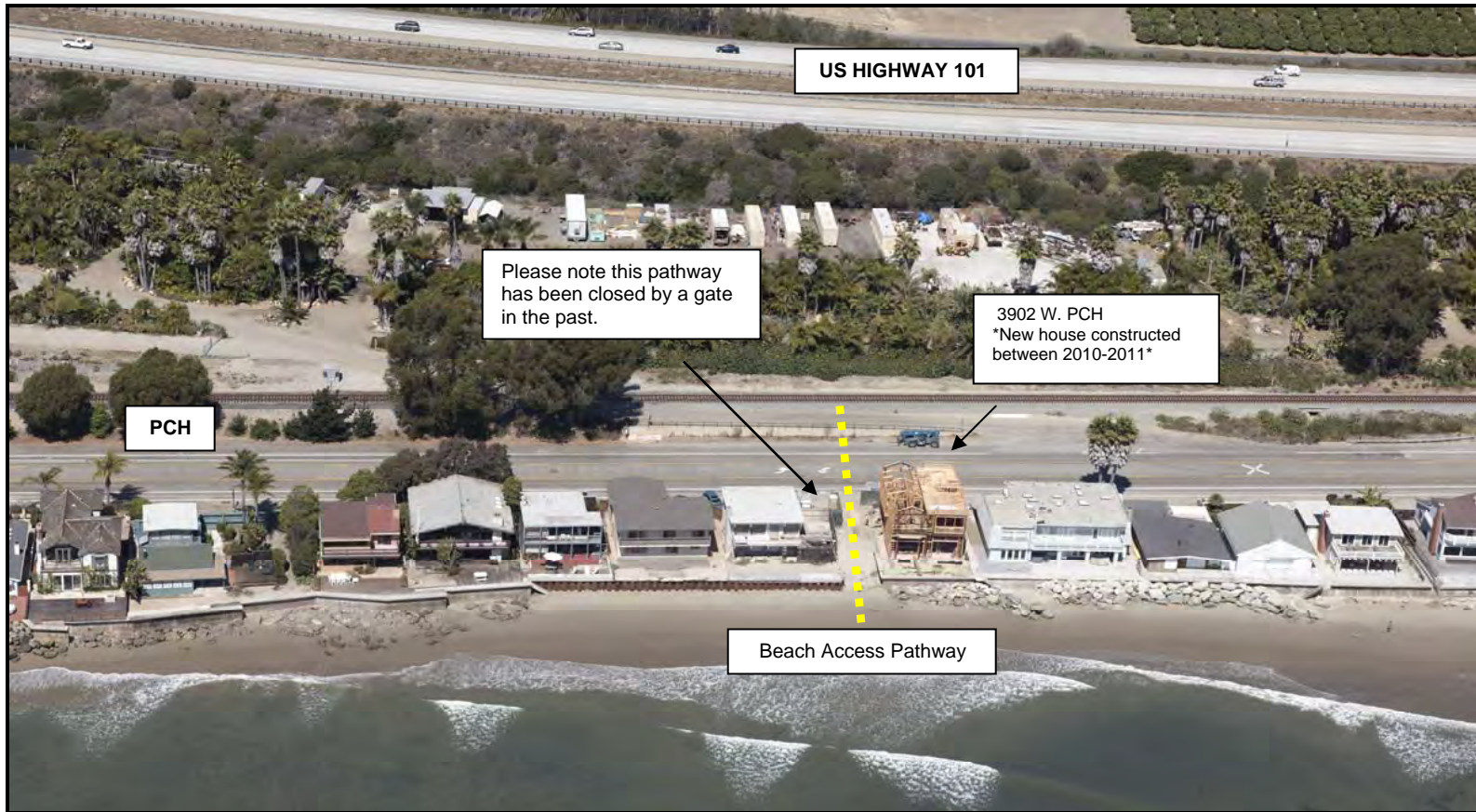
EXHIBIT 3 (2010) Zoom Aerial Photomap