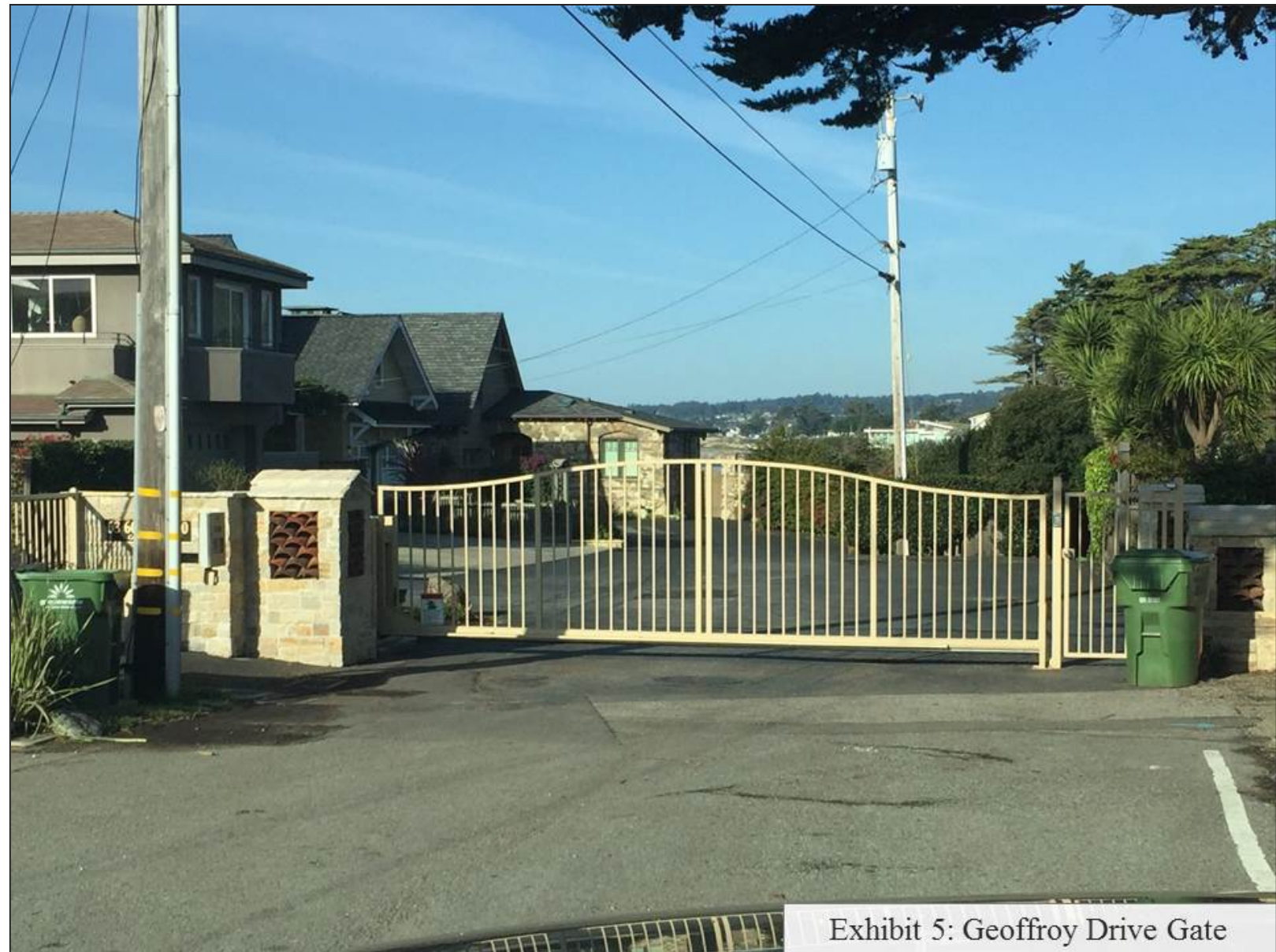
Exhibit 5: Geoffroy Drive Gate