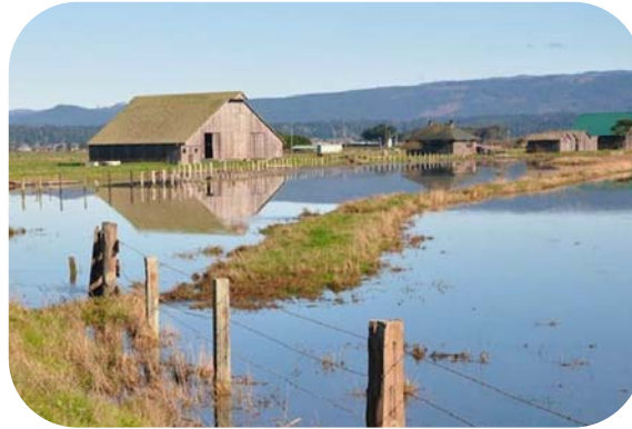
Pasture near Liscom Slough during a King Tide, Arcata CA, Dec 2012

Multiple vulnerability assessments conducted in Humboldt County identified several imminent vulnerabilities to sea level rise. Although most of the Pacific Northwest coastline north of Cape Mendocino is actively experiencing vertical land uplift, the Humboldt Bay region is experiencing a significant rate of land subsidence, and its average rate of sea level rise is the highest in the state [2,4]. Subsidence, tectonic uplift, and soil compaction could affect inundation with future sea level rise, highlighting the importance of local adjustments for vertical land motion. For Humboldt Bay, the vulnerability assessments demonstrate that sea level rise will have significant implications for daily tidal water level changes as well as storm flooding [2-7].