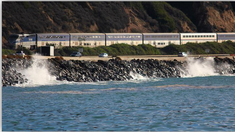
Figure 7. Photo of infrastructure at risk near Rincon Beach, Ventura, CA, during the King Tide in December 2012.