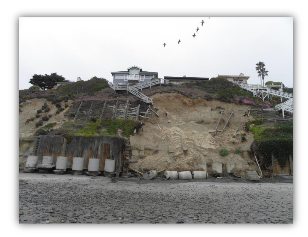
Figure 19. Photo depicting eroding bluff and exposed caissons in Encinitas, CA.

A.9e Develop triggers for foundation and structure removal: If no less damaging foundation alternatives are possible, ensure that the foundation design allows for incremental removal as the foundation elements become exposed, and develop pre-established triggers, for example when the bluff edge or shoreline comes within a certain distance of the foundation, for incremental or complete removal that will avoid future resource impacts.