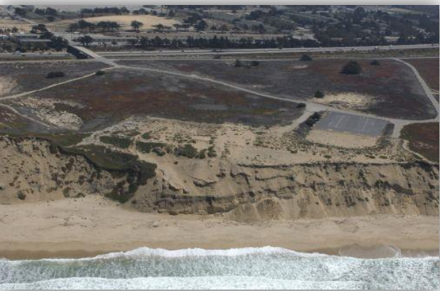
Figure 15. Photo depicting passive erosion. ( Left ) Passive erosion in front of a revetment at Fort Ord, illustrating the loss of beach where the development prevents the shoreline from migrating landward. The beach continues to migrate inland on either side of the revetment. ( Right ) Recovery of the beach following removal of the revetment and blufftop structure.

"Soft" armoring refers to the use of natural or "green" infrastructure like beaches, dune systems, wetlands, and other systems to buffer coastal areas. Strategies like beach nourishment, dune management, or the construction of "living shorelines" capitalize on the natural ability of these systems to protect coastlines from coastal hazards while also providing benefits such as habitat, recreation area, more pleasing visual impacts, and the continuation or enhancement of ecosystem services. The engineering of green infrastructure is a somewhat newer concept in some cases, and because of this, the effectiveness of different strategies in different types of environments is not necessarily well-known or tested. In cases in which natural infrastructure might not be