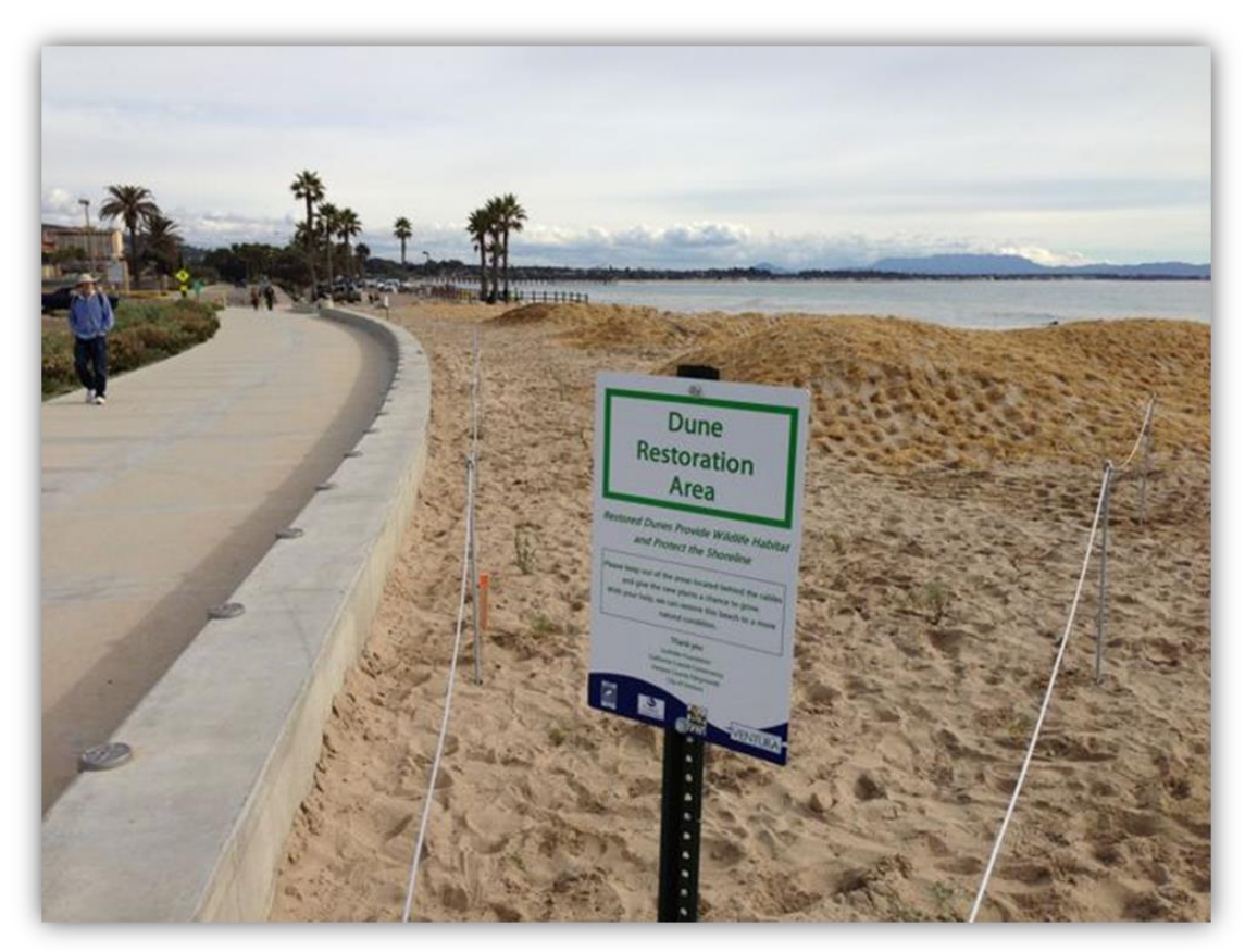
Figure 20. Photo depicting dune restoration at Surfer's Point, Ventura.

including consideration of ways that the system will change with rising sea level. CDPs for dune management plans may need to include periodic reviews so the permitted plans can be updated to address increased erosion from sea level rise, and the need for increased sand retention and replenishment.