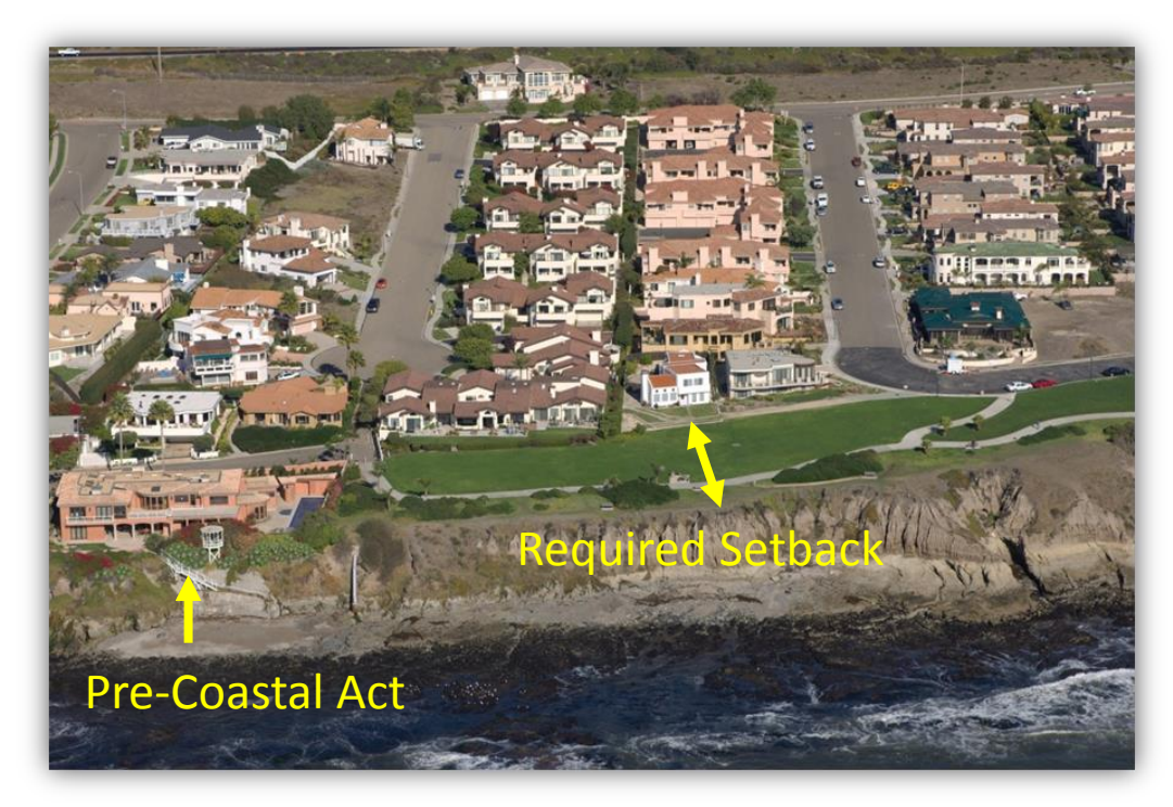
Figure 18. Photo depicting a development setback in Pismo Beach.

structure (for example, the time period over which the setback should be effective).