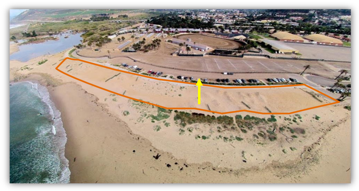
Figure 16. Photo depicting "managed retreat" and restoration. Surfers' Point Managed Shoreline Retreat project in which the parking lot was moved back and beach area was restored.

Accommodate: Accommodation strategies refer to those strategies that employ methods that modify existing developments or design new developments to decrease hazard risks and thus increase the resiliency of development to the impacts of sea level rise. On an individual project scale, these accommodation strategies include actions such as elevating structures, retrofits and/or the use of materials meant to increase the strength of development, building structures that can easily be moved and relocated, or using extra setbacks. On a community-scale, accommodation strategies include any of the land use designations, zoning ordinances, or other measures that require the above types of actions, as well as strategies such as clustering development in less vulnerable areas or requiring mitigation actions to provide for protection of natural areas even as development is protected. As with protection strategies, some accommodation strategies could result in negative impacts to coastal resources. Elevated structures may block coastal views or detract from community character; pile-supported structures may, through erosion, develop into a form of shore protection that interferes with coastal processes, blocks access, and, at the extreme, results in structures looming over or directly on top of the beach.