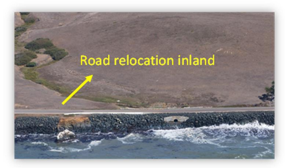
Figure 22. Photo depicting planned retreat for major public infrastructure. The Piedras Blancas Highway 1 Realignment will move nearly 3 miles (5km) of Highway 1 500 ft (152 m) inland.