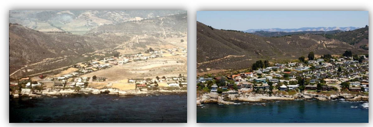
Figure 23. Photo depicting the preservation and conservation of open space along an urban-rural boundary. North end of Pismo Beach from 1972 ( left ) to 2002 ( right ).

C.5b Limit subdivisions : Update subdivision requirements to require provision for inland migration of natural resource areas or to require lots to be configured in a way that allows such migration. Lot line adjustments may sometimes be appropriate if they facilitate locating physical development further away from hazards or sensitive resources.