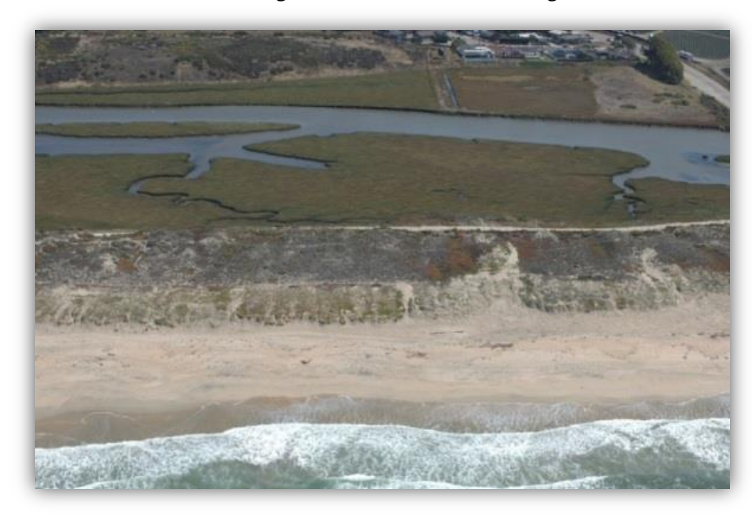
Figure 24. Photo depicting habitat protection at Salinas River State Beach. Dunes are roped off to protect Snowy Plover nesting habitat.