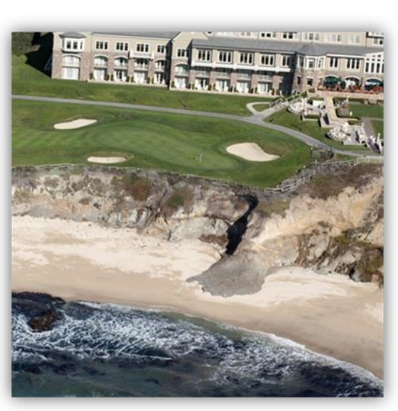
Figure 21. Photo depicting removal of shoreline protective structure. Removal of rock revetment restores access and allows natural bluff erosion at the Ritz Carlton in Half Moon Bay.

A.25a Remove shoreline protective structures located on public lands: Over time, sea level rise will cause the public trust boundary to move inland. If the structures