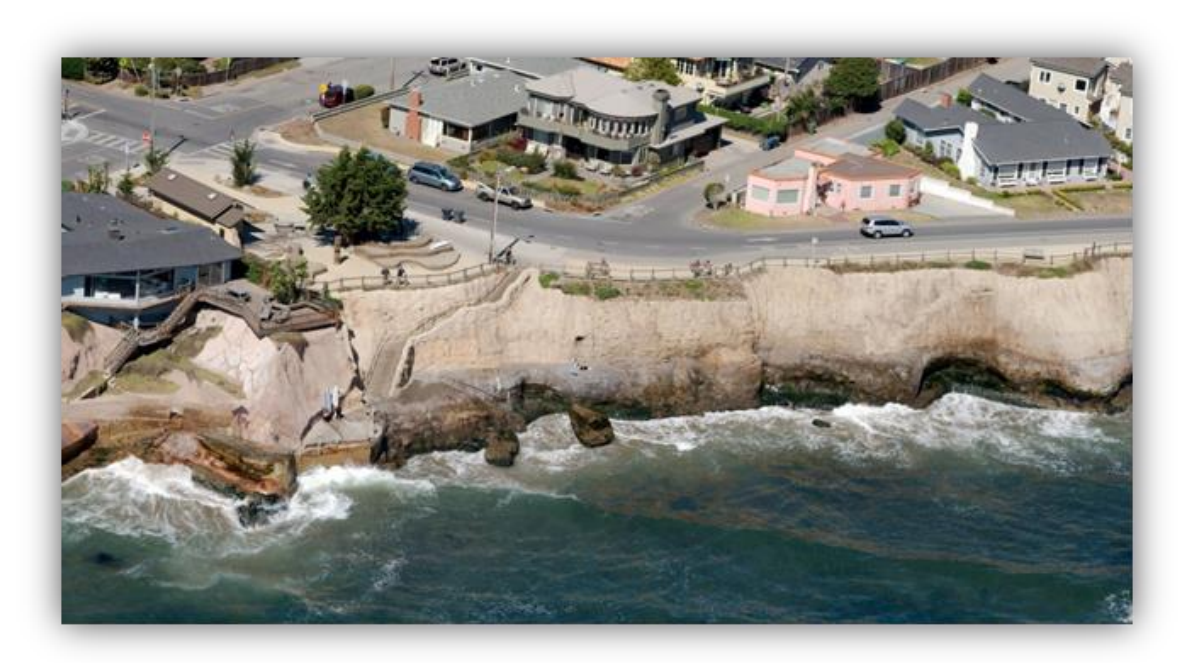
Figure 25. Photo depicting protection of visual resources and public access. A seawall visually blends in with the natural bluff while surfing access is also provided at Pleasure Point, Santa Cruz (2013).