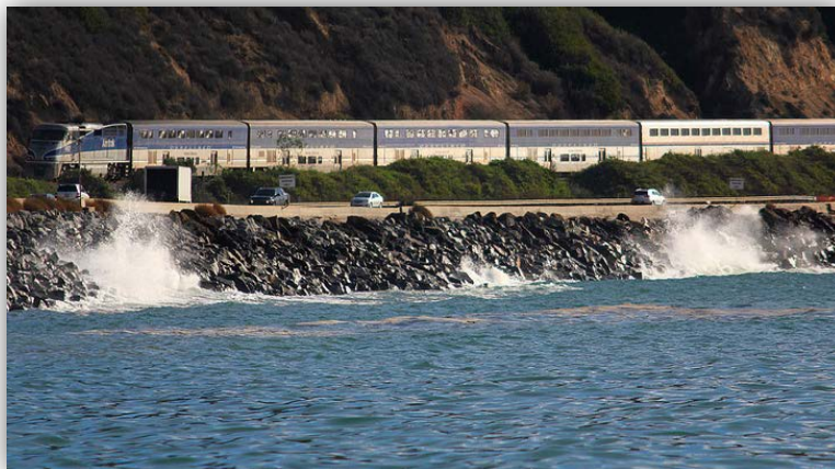
Figure 7. Photo of infrastructure at risk near Rincon Beach, Ventura, CA, during the King Tide in December 2012.