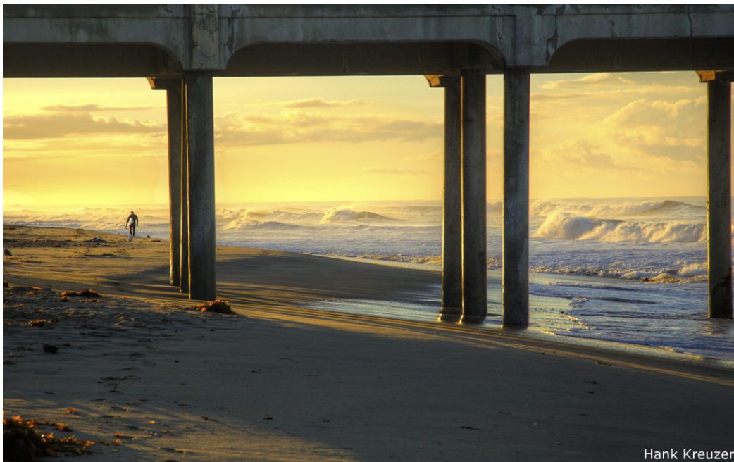
Huntington Beach, CA

Prepared pursuant to the provisions of Section 309 of the federal Coastal Zone Management Act for the Office for Coastal Management, National Ocean Service, National Oceanic and Atmospheric Administration and with financial assistance from grant award NA19NOS4190073.