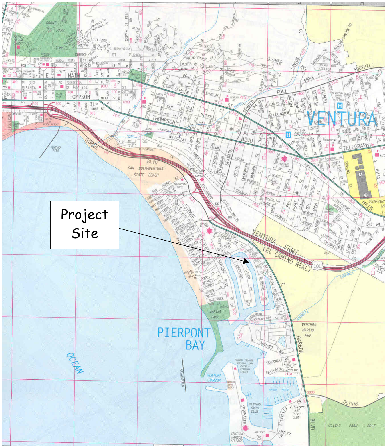
Exhibit 1 CDPA No. 4-06-046 Vicinity Map