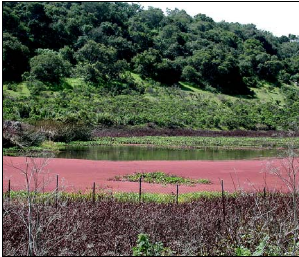
CDP 3-85-005 Watts

OTD accepted by the Ekhorn Slough Foundation (ESF)