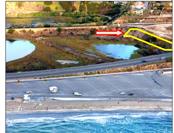
CDP 6-85-589 Solana Beach Inn Suites