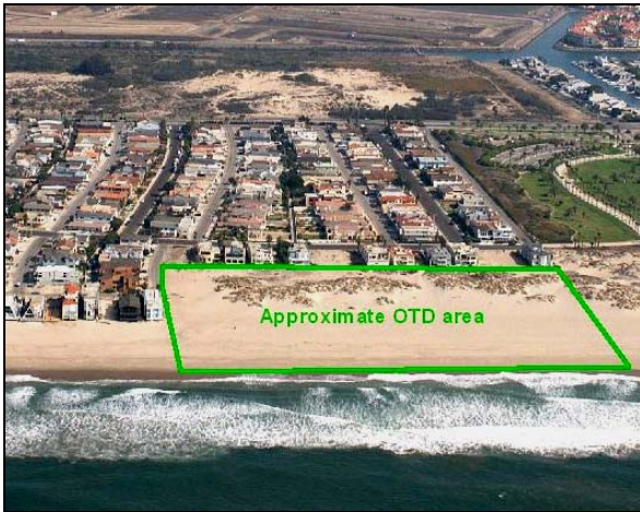
CDP 216-016 Andrews