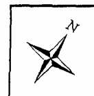
EXHIBIT # 2 PAGE 1 OF 1