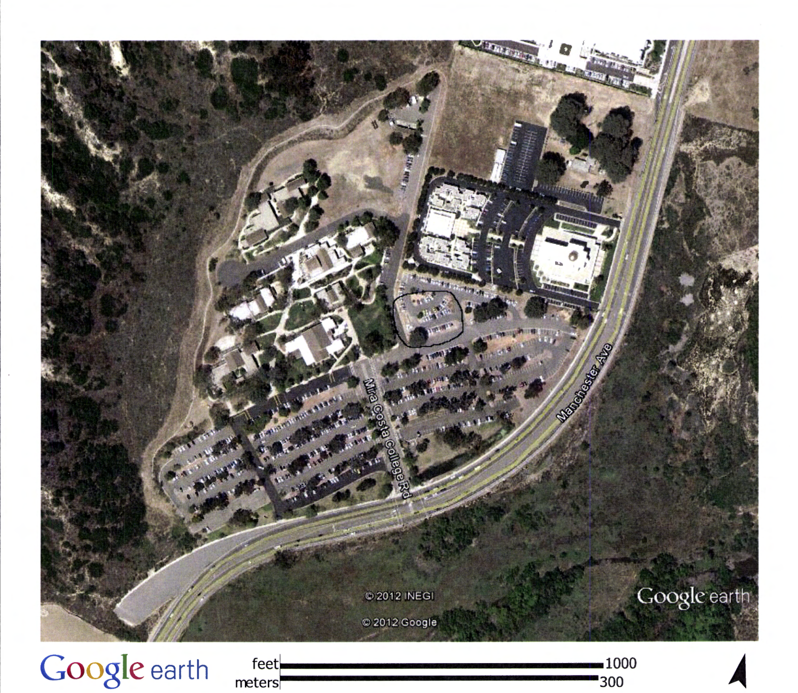
EXHIBIT NO. 2 APPLICATION NO. 6-84-578-A9 Aerial View