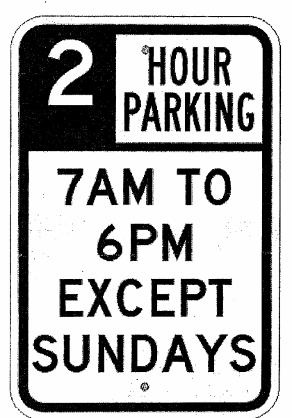
EXHIBIT NO. 3 APPLICATION NO. 6-05-040-A2 Parking Signage