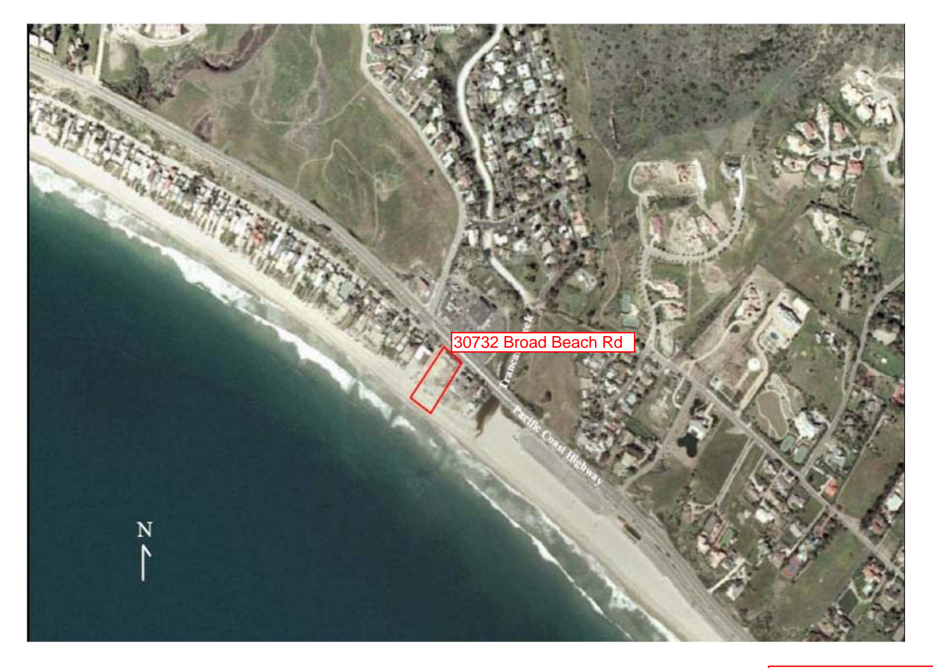
Exhibit 4 Appeal A-4-MAL-10-008 Location Map