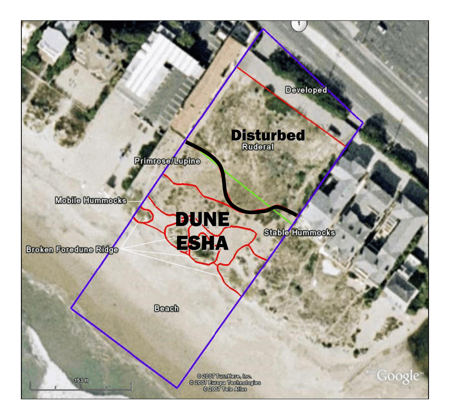
Exhibit 7 Appeal A-4-MAL-10-008 ESHA Delineation Map