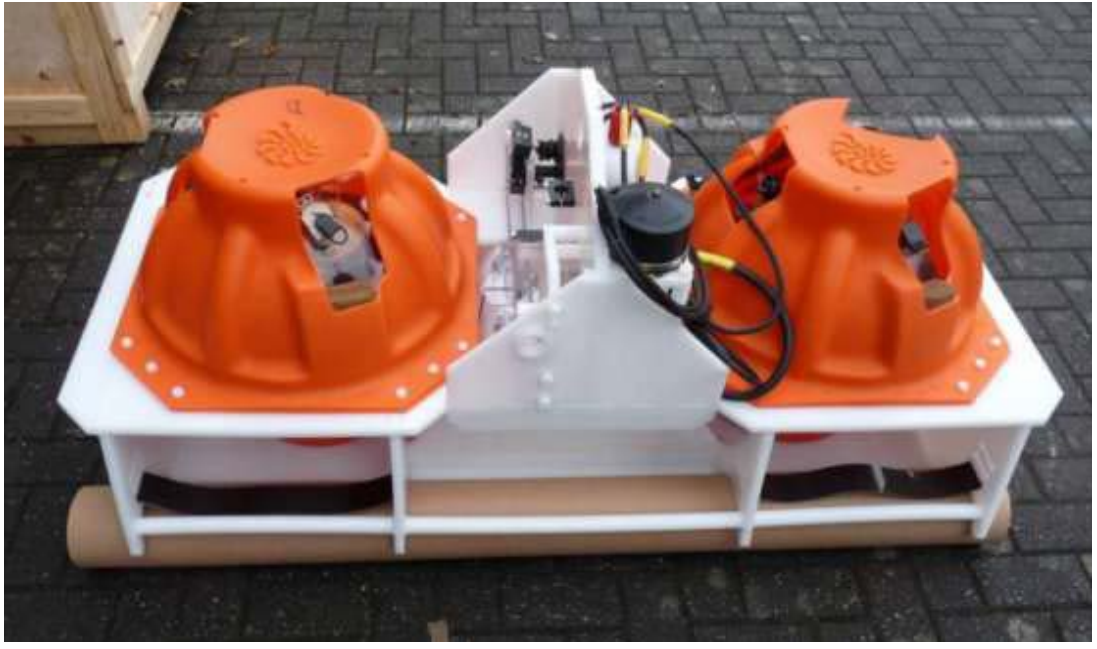
SHORT-TERM OBS UNIT DESIGN