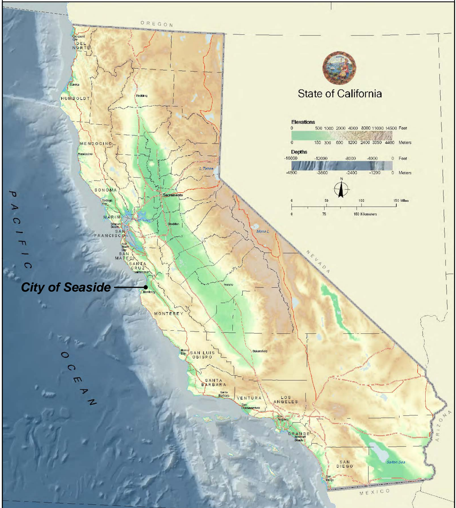
Exhibit 1- City of Seaside Location Map