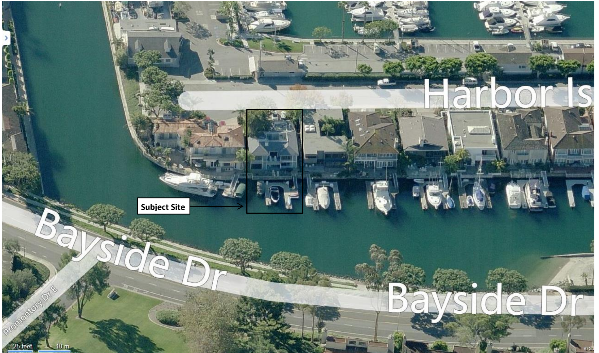
Exhibit 1: 836 Harbor Island Drive, Newport Beach, Orange County