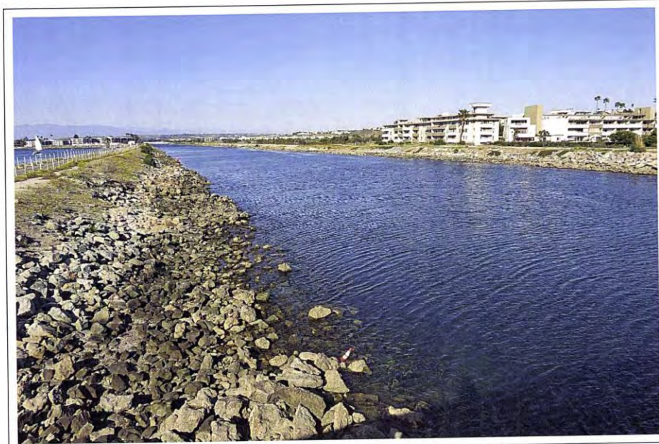
March 6, 2014. View Upstream of Lower Ballona Channel from Pacific Ave Bridge.

D:\Projects\COLADPWJ250\Graphics\lex_SP1.ai