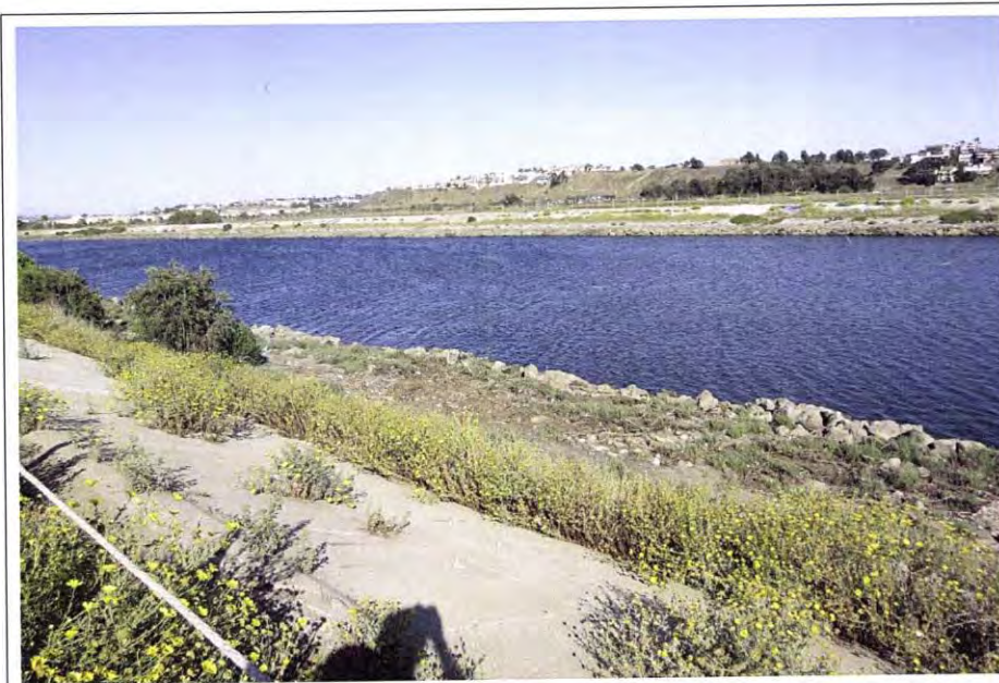
March 6, 2014. View Upstream of Lower Ballona Channel from North Bank.