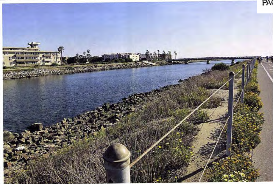
March 6, 2014. View Downstream from North Bank of Lower Ballona Channel toward Ocean.