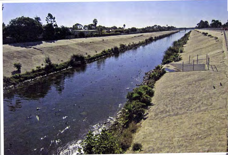
March 6, 2014. View Downstream from Centinela Ave.