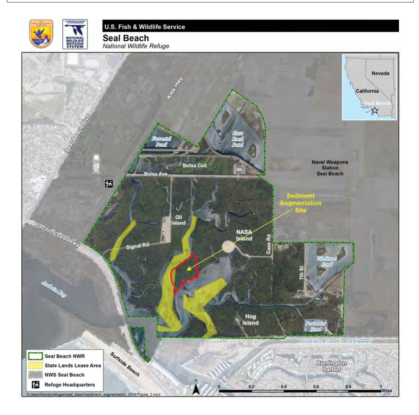
Exhibit 2 CD-0002-15

Thin-Layer Salt Marsh Sediment Augmentation Pilot Project - Seal Beach National Wildlife Refuge Vicinity Map