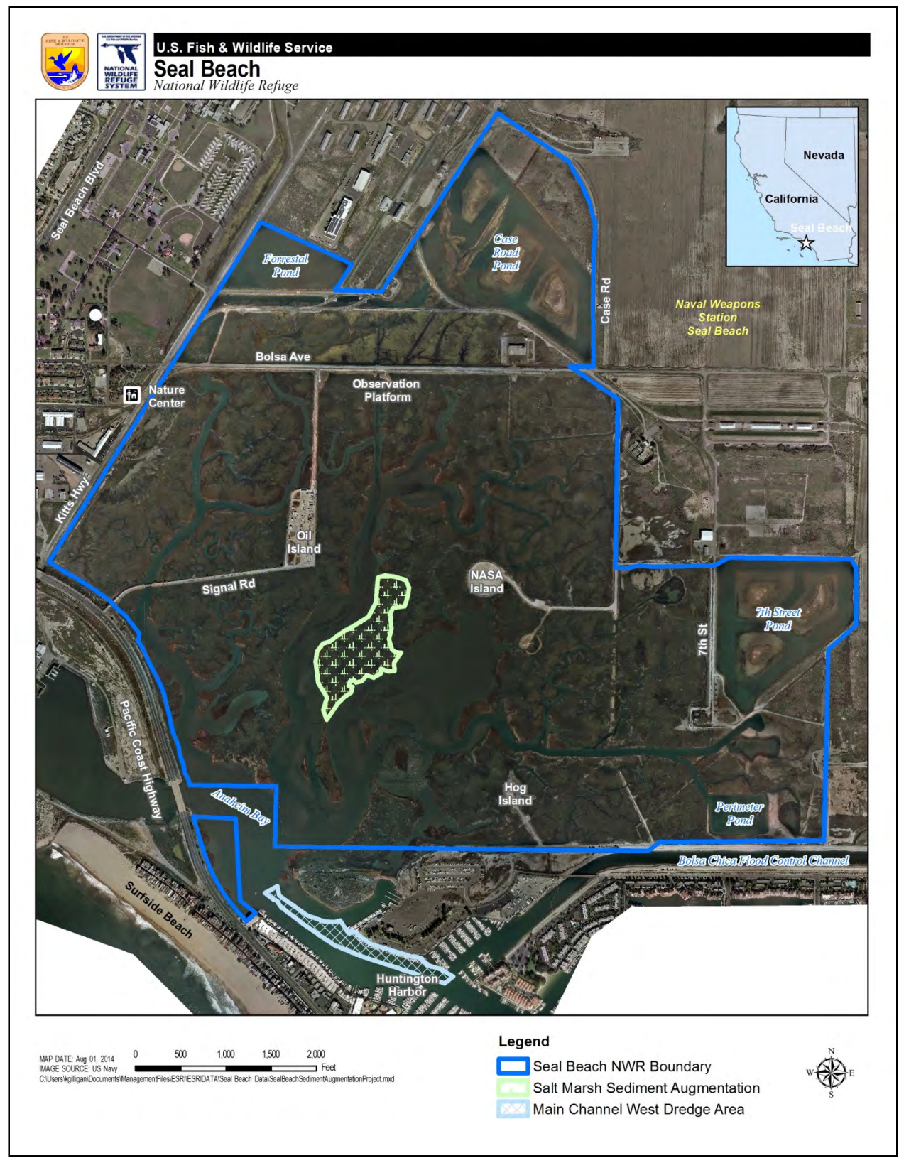
Figure 4. Relationship of the Project Site to the Main Channel West Dredge Area

Final Initial Study/Environmental Assessment - Seal Beach National Wildlife Refuge Thin-Layer Salt Marsh Sediment Augmentation Pilot Project Page 13