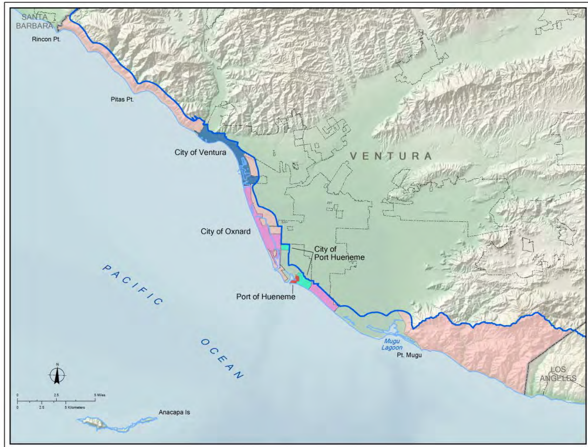
Figure 1. Ventura County Coastal Zone LCP Jurisdictions