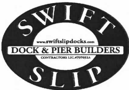
EXHIBIT # 2 PAGE 2 OF 2