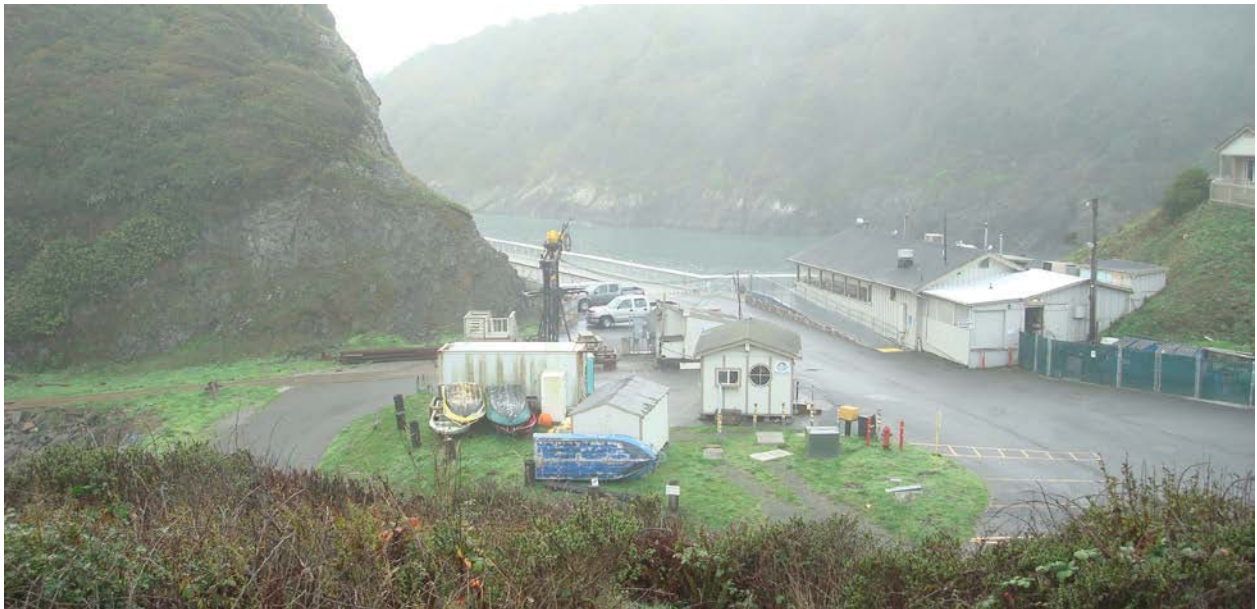
Photo 2: View to the West from the coastal bluff. Proposed area for the visitor center shown in the center of the photo.