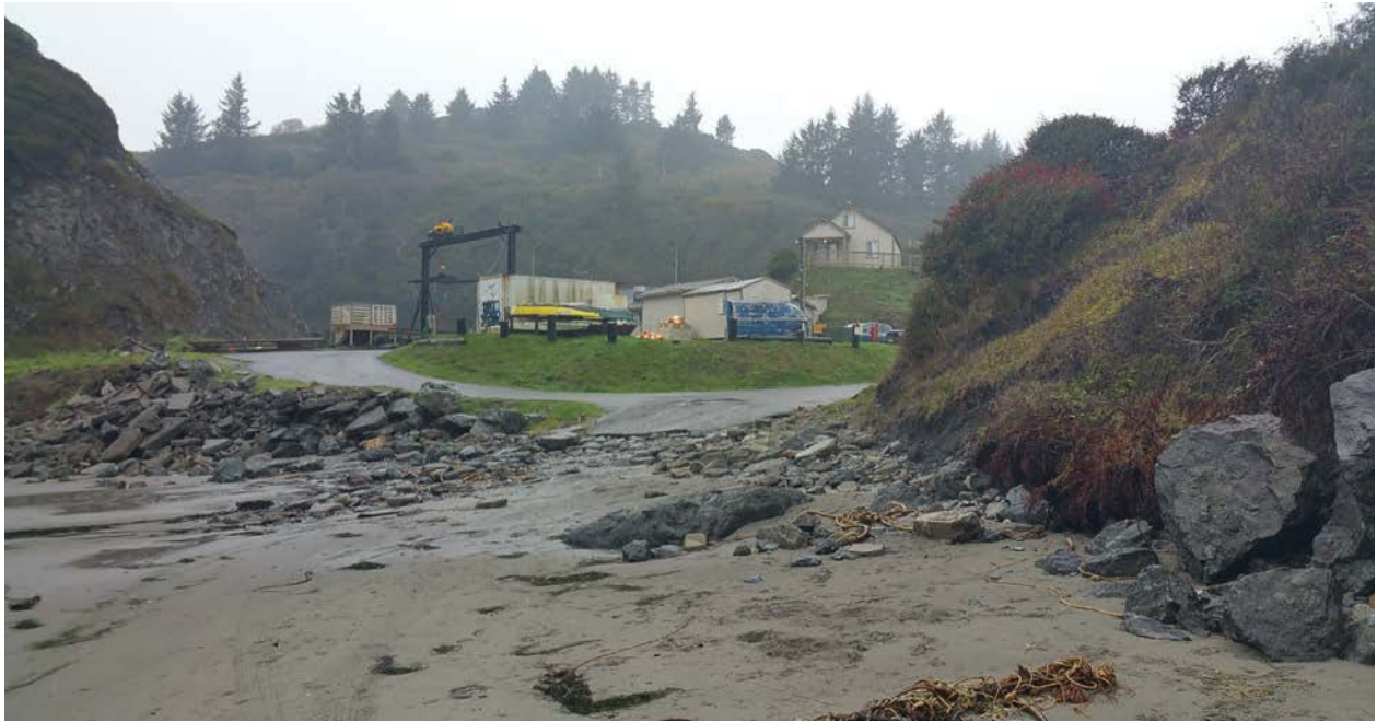
Photo 1: View to the north from the southern beach. Areas proposed for the visitor center located in the center of the photo.