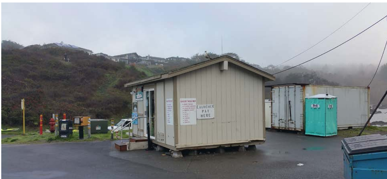
Photo 4: View to the east from the Seascope Restaurant. Areas proposed for the visitor center include the paved areas shown in the photo.