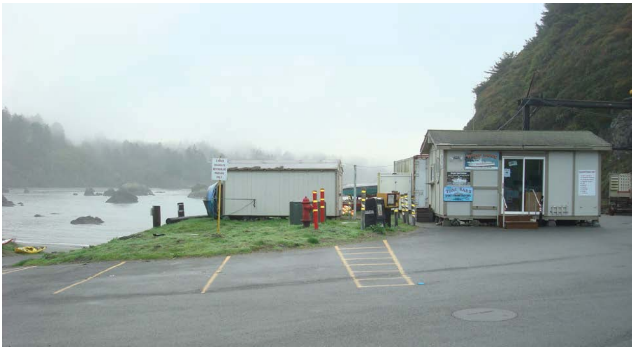
Photo 3: View to the south from the Bay Street parking lot. Areas proposed for the visitor center include the tackle shop to the right and the storage shed behind and to the left of the tackle shop. The utility bay represented by the green grass will not be disturbed under the Proposed Project.