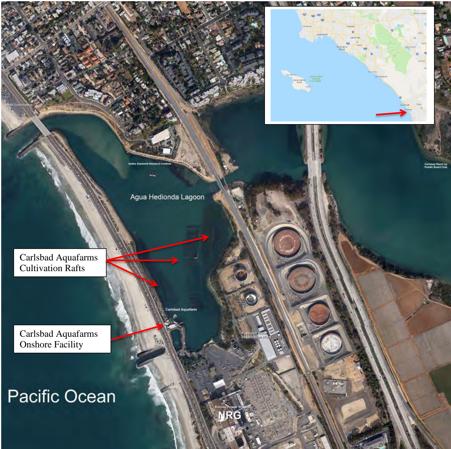
EXHIBIT 1 – Project Location