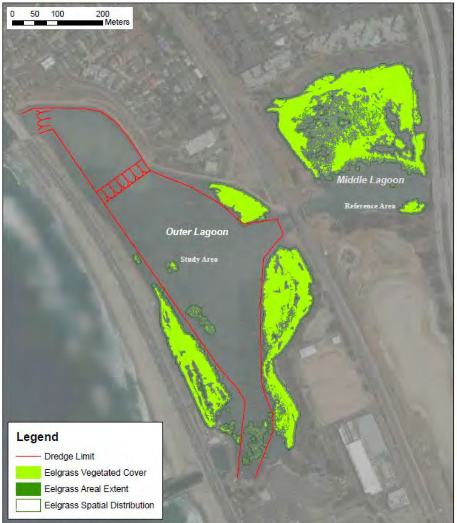
EXHIBIT 4 – Results of May 2018 Eelgrass Survey