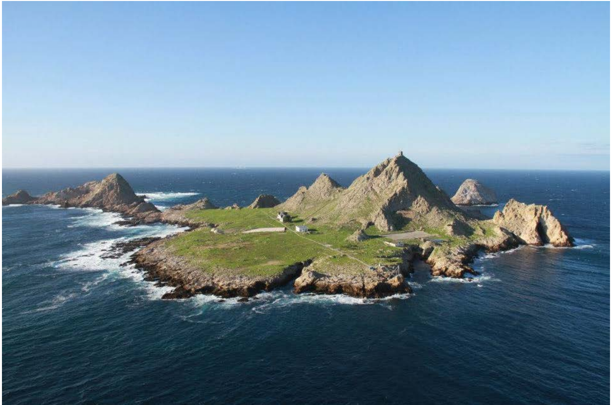
South Farallon Islands, view to the west (USFWS FEIS, March 2019).