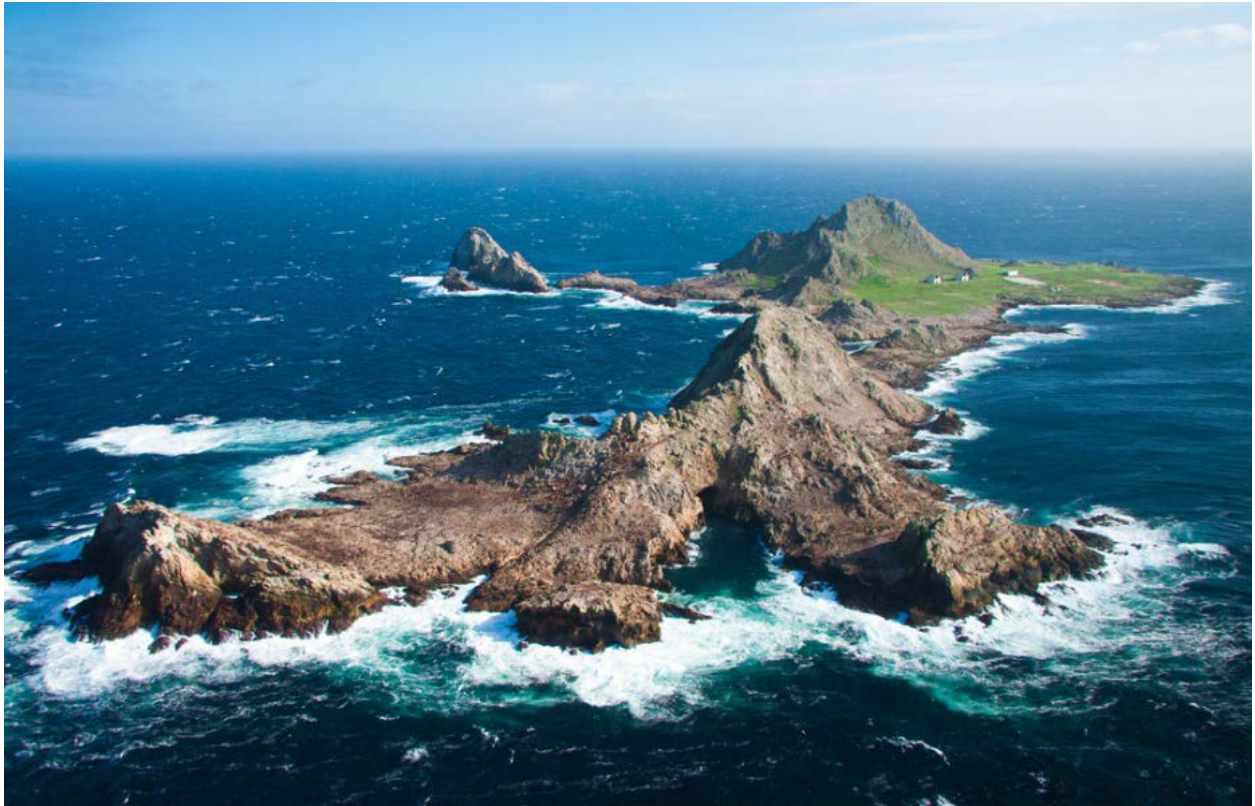
South Farallon Islands, view to the east (USFWS FEIS, March 2019).