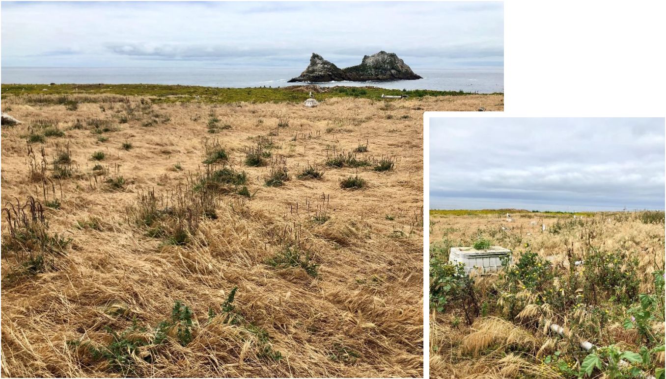
FIGURE 2. Above: Invasive non-native vegetation is proliferating across the South Farallon Island landscape. Here, a variety of European grasses New Zealand spinach ( Tetragonia tetragonioides ), and cut leaf plantain ( Plantago coronopus ) are shown encroaching on the native goldfields towards the background. Among their adverse impacts, these invasive species outcompete native flora, alter soil conditions, and create an unnaturally dense cover of vegetation that limits available space and alters ground conditions needed for seabird nesting. The presence of house mice, which suppress native plant populations via seed consumption as well as acting a dispersal agent for non-native plant material, is likely playing a significant role in the continued loss of the native island plant community at the South Farallones. Right: Another example of how non-native vegetation is altering the Farallones landscape – an assortment of taller-growing European grasses, mallow ( Malva spp.), curly dock ( Rumex crispus ), sweet fennel ( Foeniculum vulgare ), and other species create thicket-like conditions that can severely limit wildlife agility in when entering and returning to their underground burrows. This renders them vulnerable to predators such as overwintering burrowing owls.