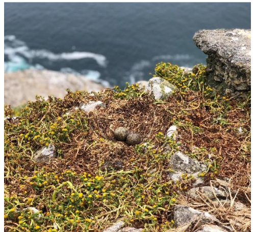
FIGURE 1. Above and upper right: Maritime goldfield ( Lasthenia maritima ) is the primary native species across the South Farallones landscape – it is a small annual plant with shallow roots suited to the islands along the California and Oregon coasts. The population at South Farallon Island is the largest known. Lower right: Goldfield is also a preferred nesting material for gulls and other seabirds; note the gull eggs perched on a cliff amidst a bed of recently-harvested plant material.