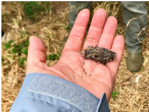
FIGURE 3. Above: A shallow cave dwelling used by a burrowing owl the previous winter, littered with feathers and bones from its prey. The majority of these appear to be the remains of ashy storm petrels. Upper left: A largely-intact wing left from an ashy storm petrel carcass. Lower left: An owl pellet containing bones and feathers was identified to consist of ashy storm petrel remains on the basis of the petrel’s characteristic musky scent, which was still present at the time of our site visit to South Farallon Island on May 7 th , 2019.