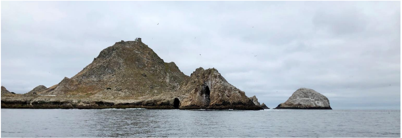
FIGURE 4. View of the eastern side of South Farallon Island with Sugarloaf [islet] to the right. Two caves can be seen on the right end of South Farallon, including Great Murre Cave, which is the taller of the two and is primarily used by Common Murres ( Uria aalge ). These caves are examples of areas where aerial bait dispersal will not be feasible and house mouse eradication operations will instead have to rely on concurrent use of bait stations and other on-the-ground operations to ensure full coverage for the target species.