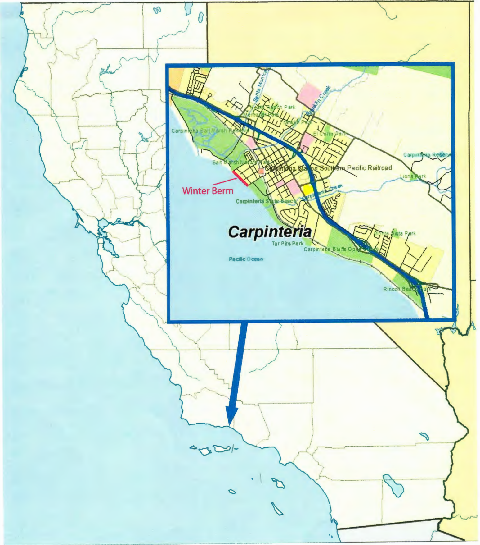
Carpinteria Winter Protection Berm Vicinity Map Carpinteria, California Santa Barbara County

Exhibit 1 Application No. 4-20-0391 Vicinity Map