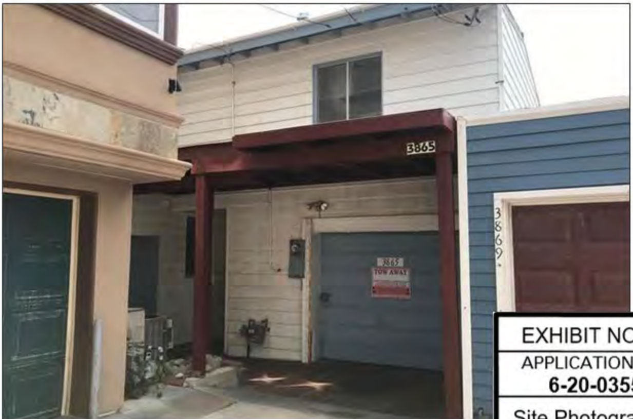
EXHIBIT NO. 3 APPLICATION NO. 6-20-0355