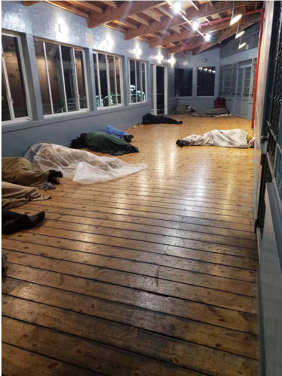
Exhibit 3 – Santa Monica Pier Observation Deck Space