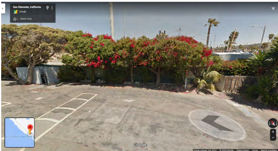
Photo 2: View of southern portion of existing 6' tall chain link fence proposed to be replaced with a new 5-ft. 4 in. tall block wall