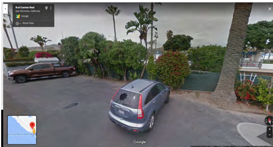
Photo 3: View of northern portion of existing 6' tall chain link fence proposed to be replaced with a new 5-ft. 4 in. tall block wall