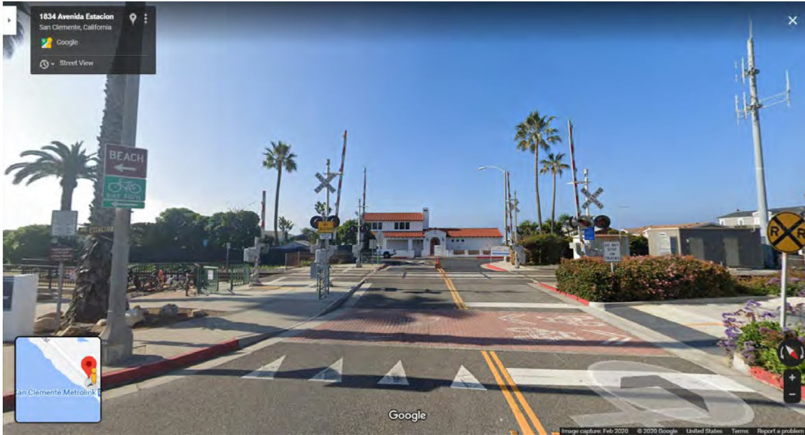
Photo 1: View of pedestrian and vehicular entry point to Capistrano Shores Mobile Home Park. Note: View of ocean blocked by existing structures.