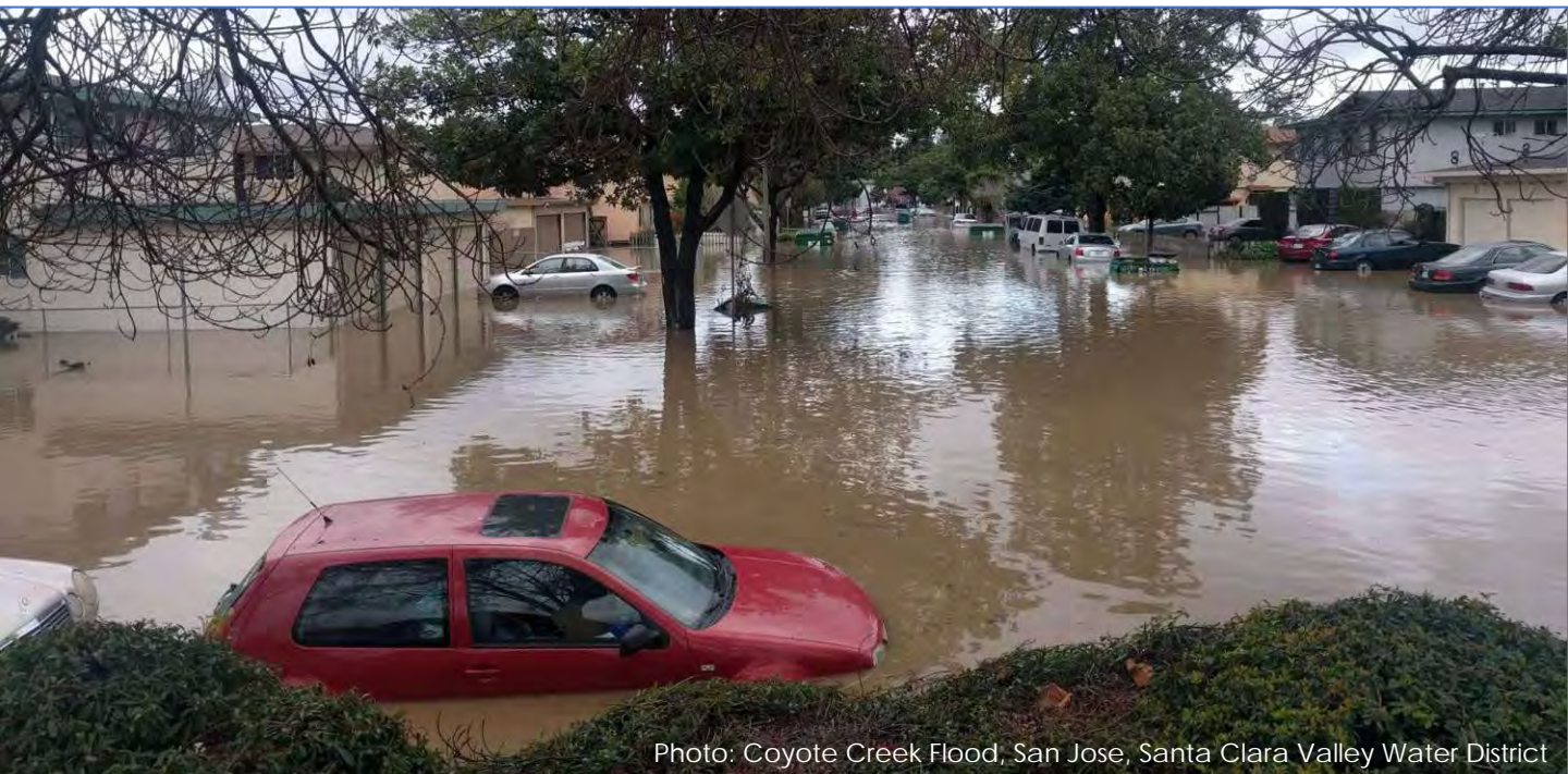
Photo: Coyote Creek Flood, San Jose