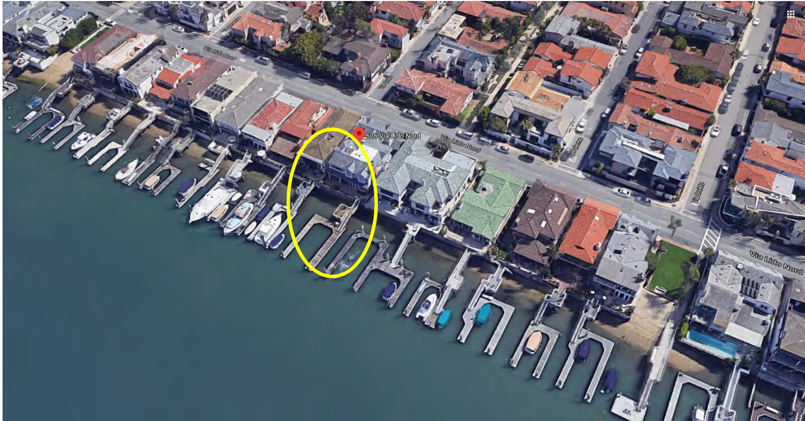
5-19-0979 San Jacinto LLC 626 Via Lido Nord, Newport Beach View of the Subject Site