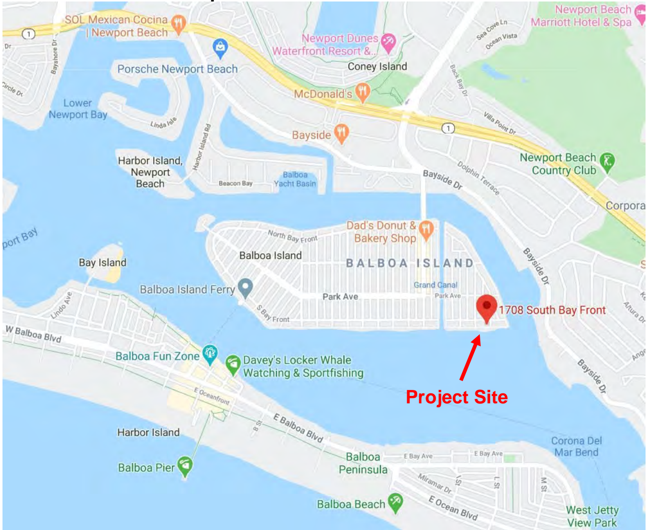
Exhibit 1 – Location Map