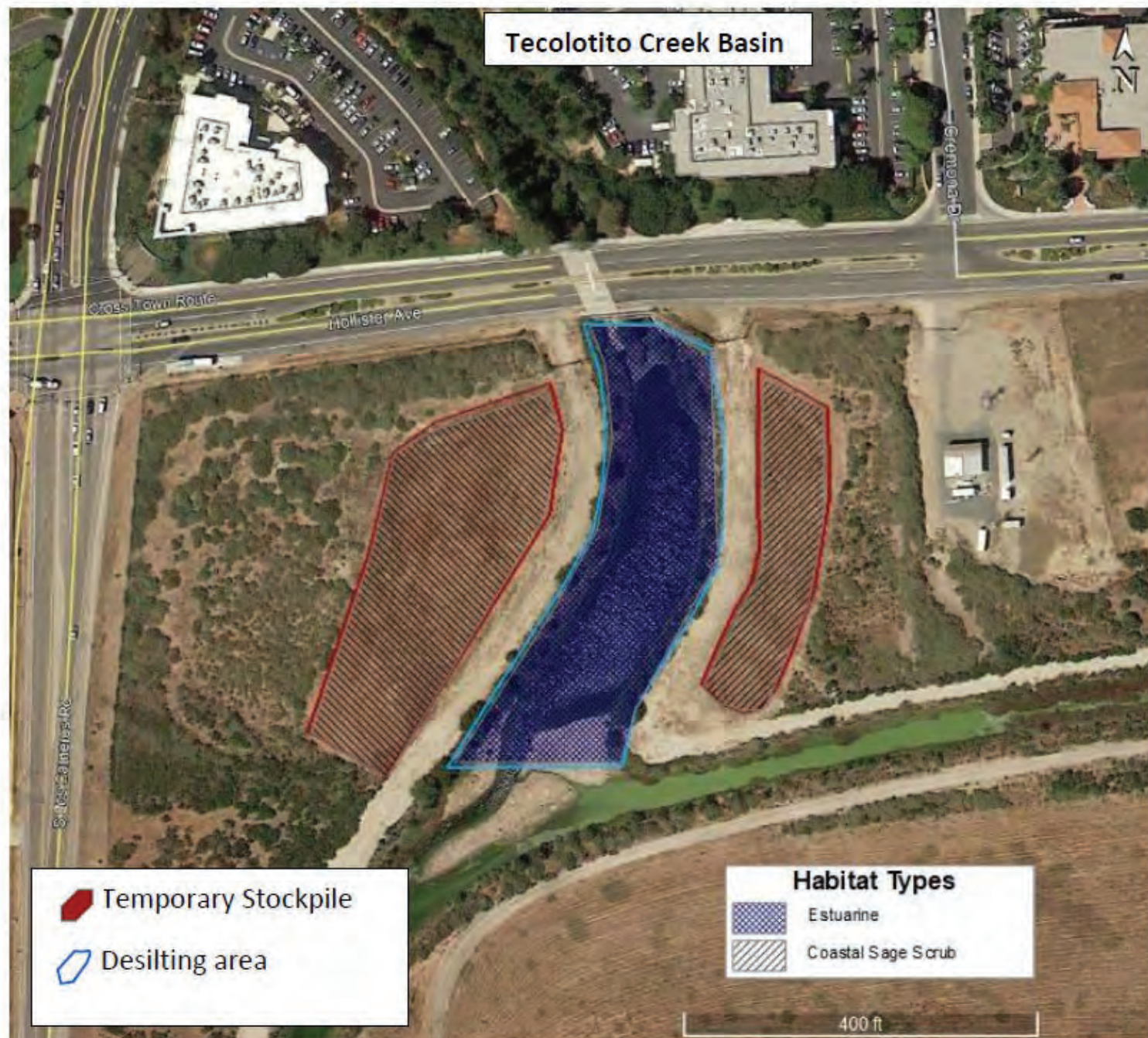
Exhibit 3. 4-21-0379 Santa Barbara County Flood Control Tecolotito Creek Dragline Desilting Location