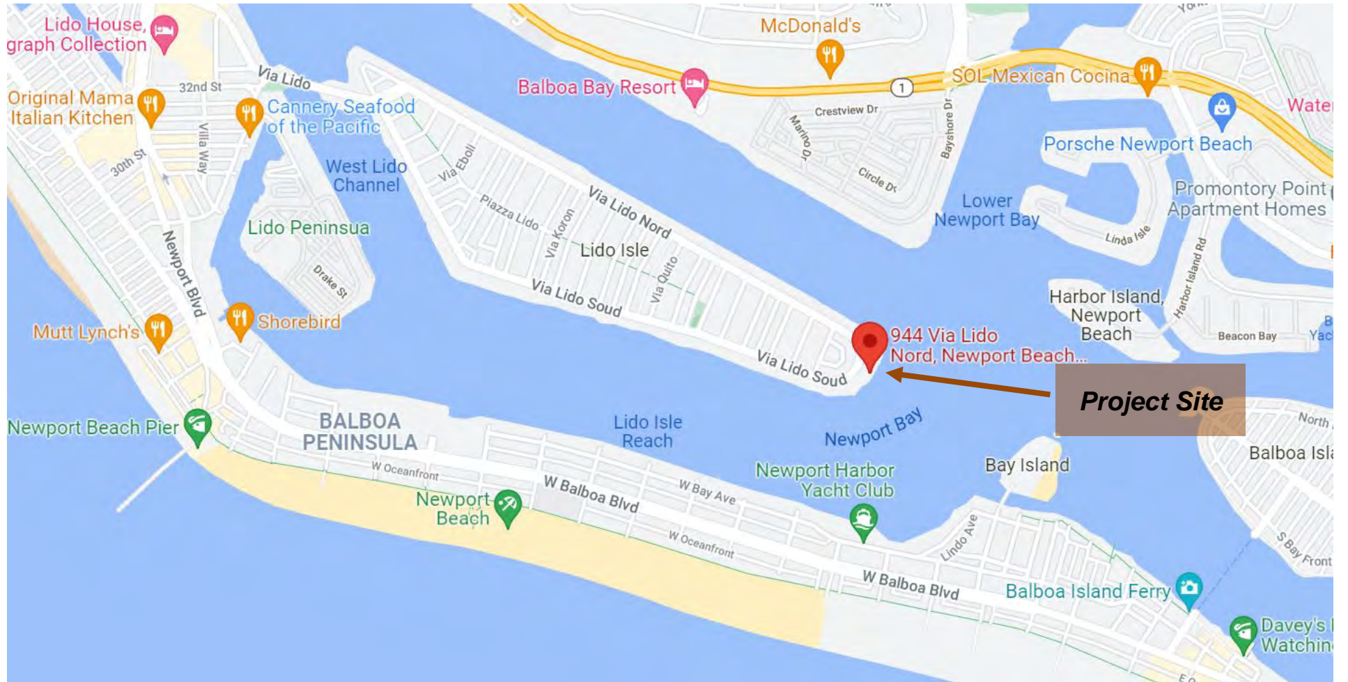
Exhibit No. 1 – Location Map