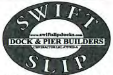
Exhibit 2 Page 1 of 1

SWIFT SLIP DOCK & PIER BUILDERS, INC. 6351 Industry Way, Westminster, CA 92683 Phone: (949) 631-3121 Fax: (714) 509-0618