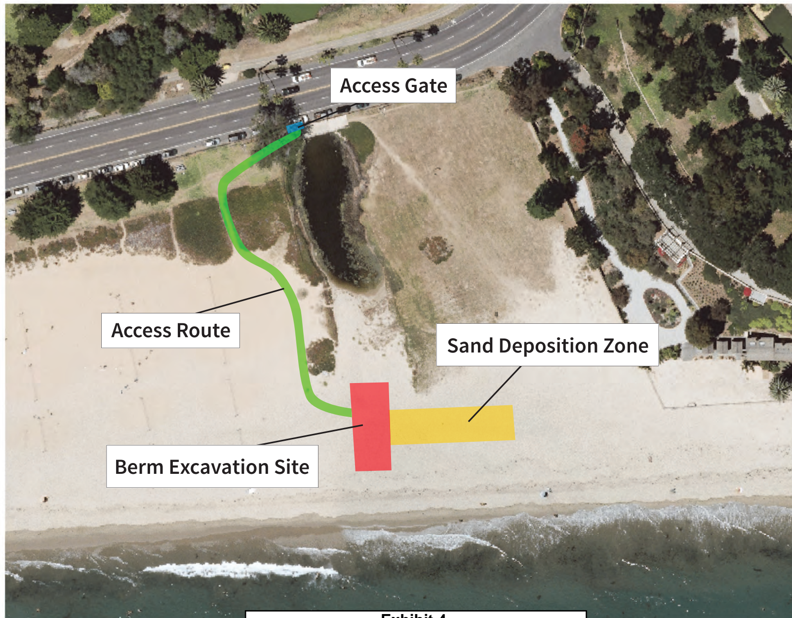
Exhibit 4. 4-21-0227 City of Santa Barbara Parks and Recreation Department Beach Elevation Management Activities Plan