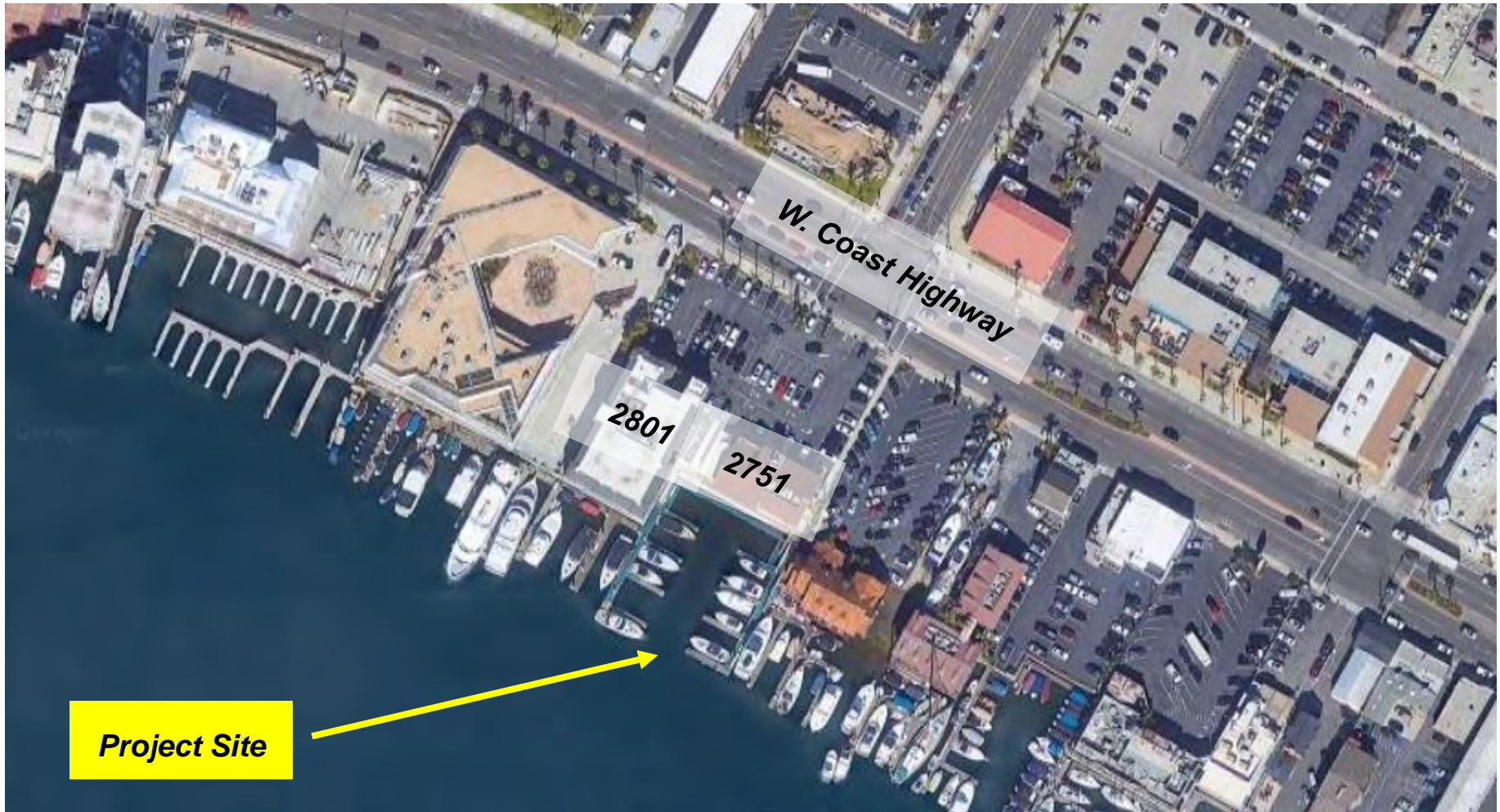
Exhibit No. 1 – Location Map