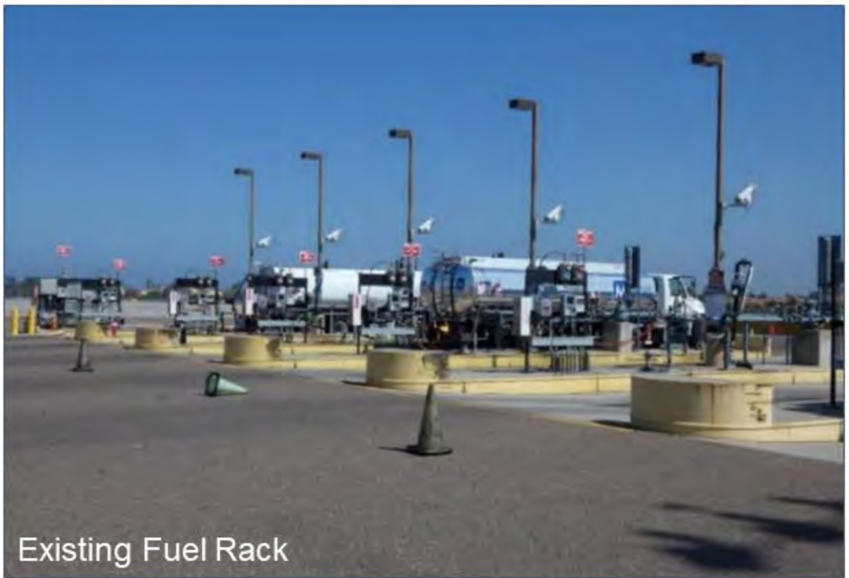
Existing Fuel Rack