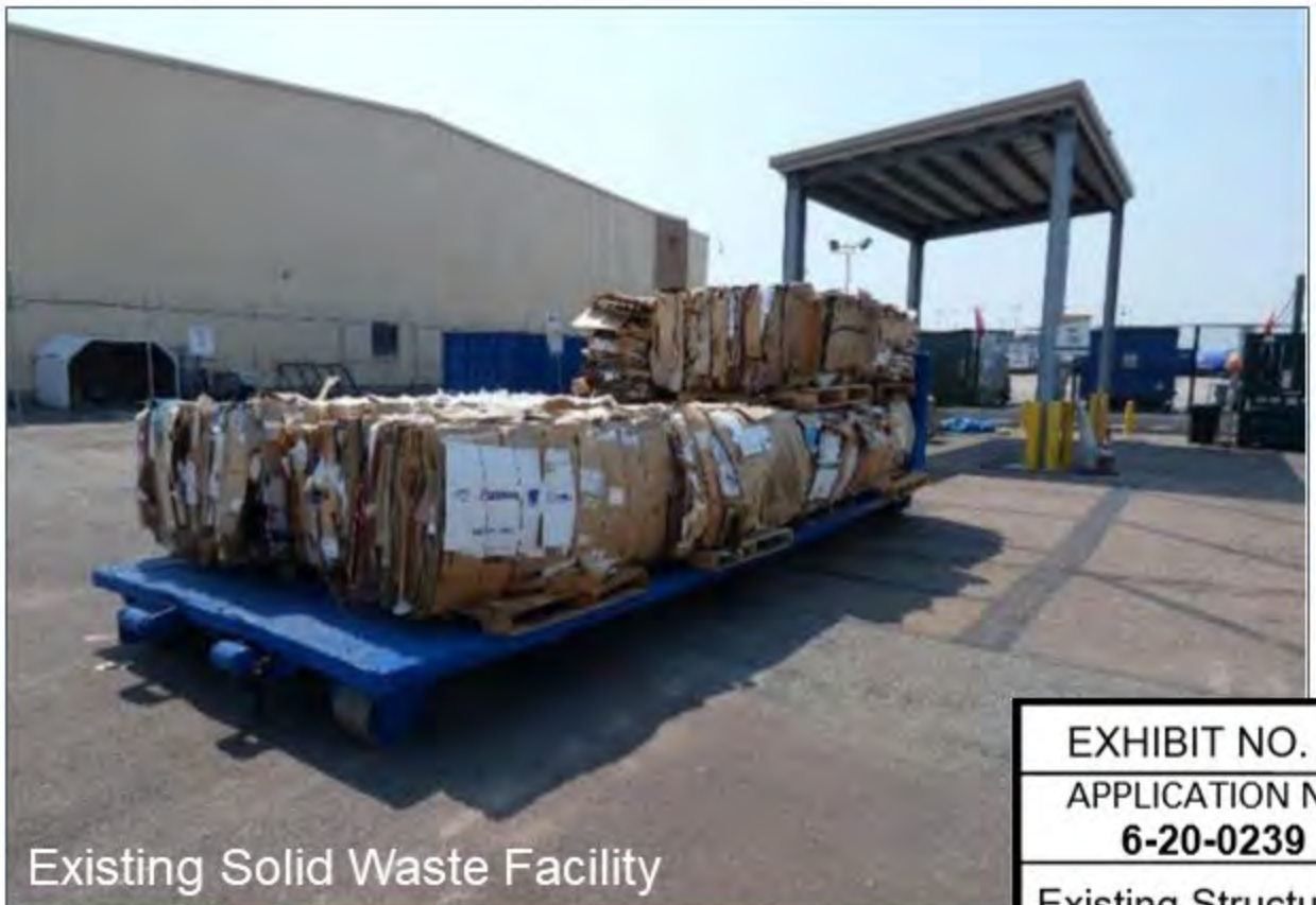
Existing Solid Waste Facility