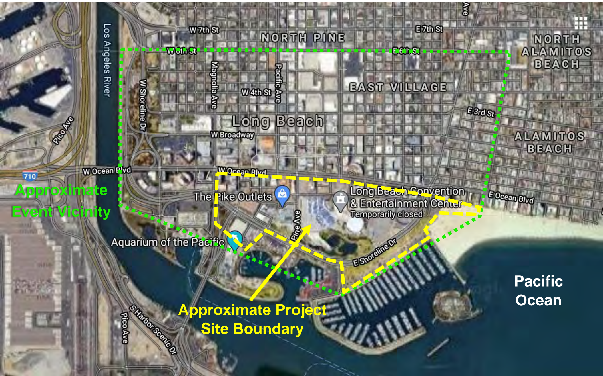
Exhibit 1 – Vicinity Map