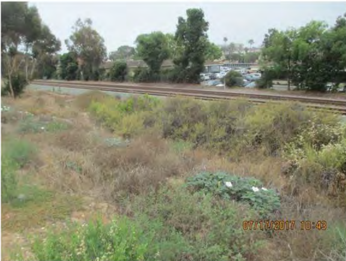
Photo 3. Coastal sage scrub along railroad, near G and F Streets