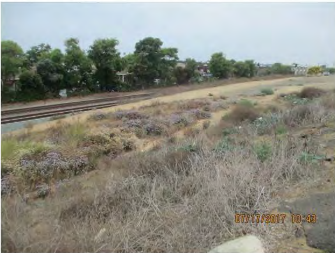
Photo 4. Disturbed habitat, coastal sage scrub, near above areas