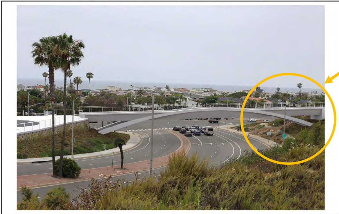
Figure 4-1: Updated Bridge Design Ocean Viewpoint

Superior Avenue Pedestrian and Bicycle Bridge and Parking Lot Project MND Addendum Newport Beach, California