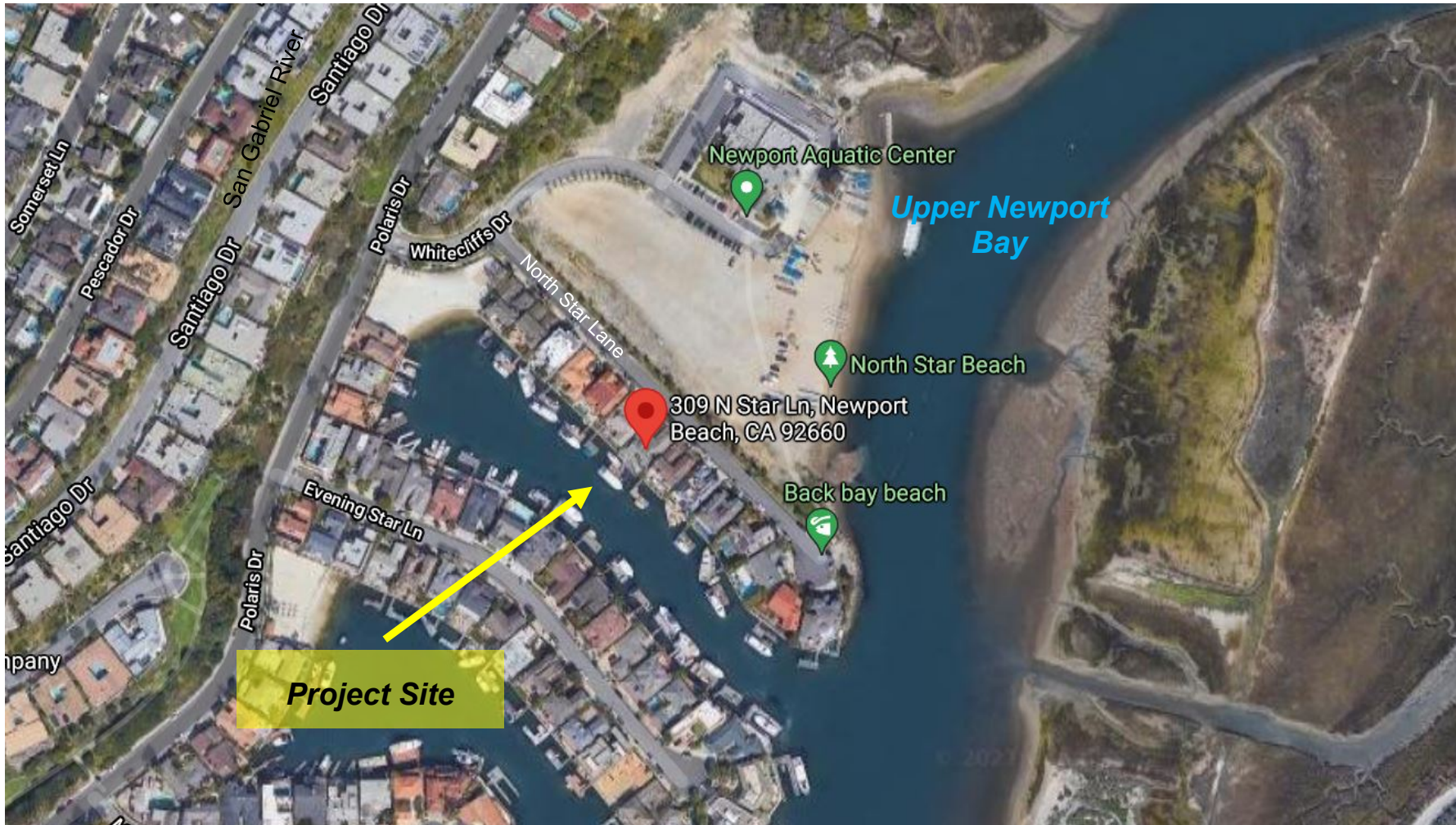
Exhibit No. 1 – Location Map