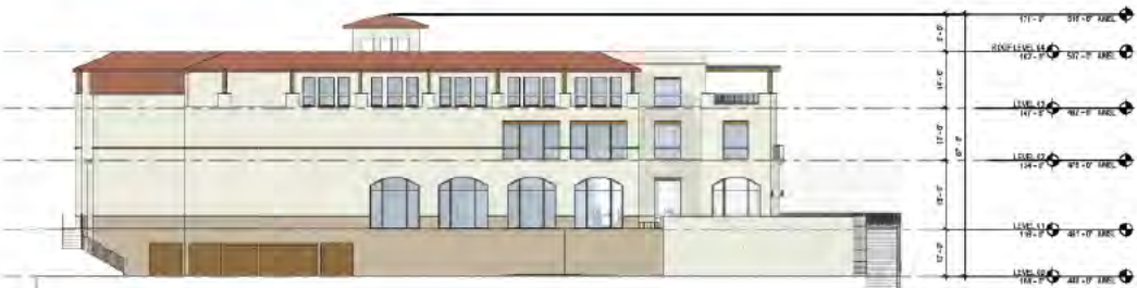
① BUILDING 2- WEST ELEVATION 1/8" = 1'-0"