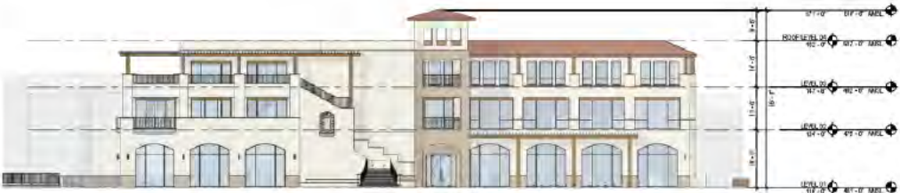
③ BUILDING 2- EAST ELEVATION 1/8" = 1'-0"