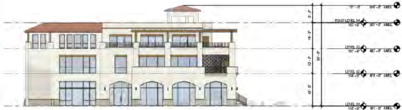
② BUILDING 2- SOUTH ELEVATION 1/8" = 1'-0"