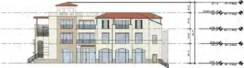
④ BUILDING 2- NORTH ELEVATION 1/8" = 1'-0"