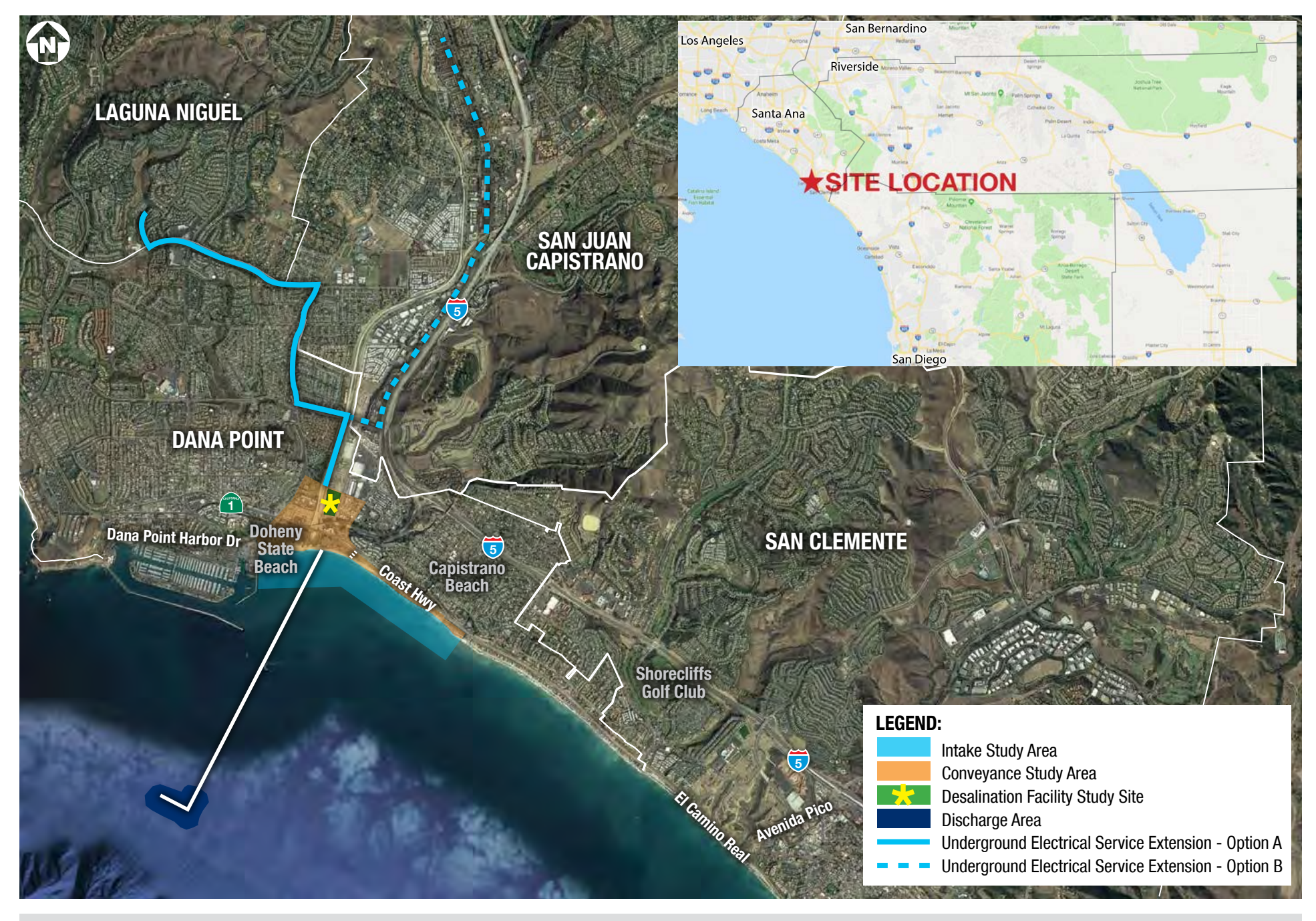
EXHIBIT 3-1: Regional Vicinity

South Coast Water District Doheny Ocean Desalination Project