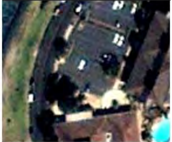
Sept 2000 (no tents)