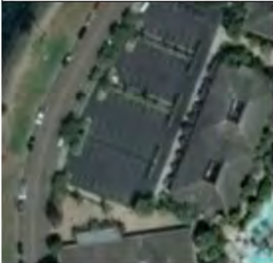
Aug. 2017 (no tents)