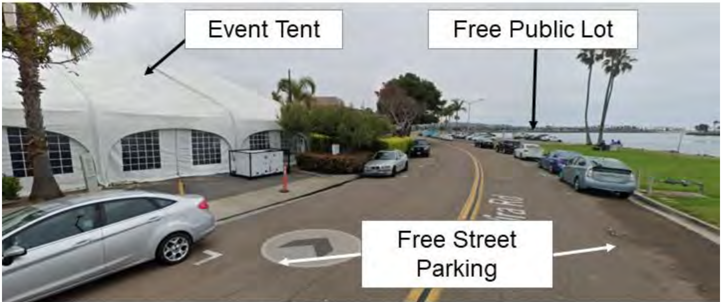
Looking South on Quivira Rd