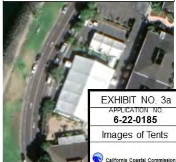
EXHIBIT NO. 3a