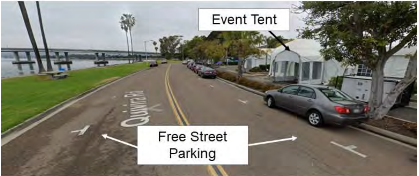
Looking North on Quivira Rd