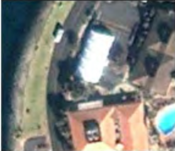
January 2000 (unpermitted tent)