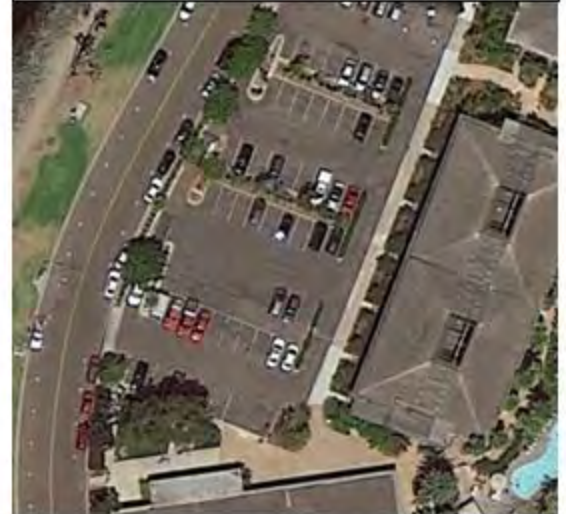
Aug. 2010 (no tents)