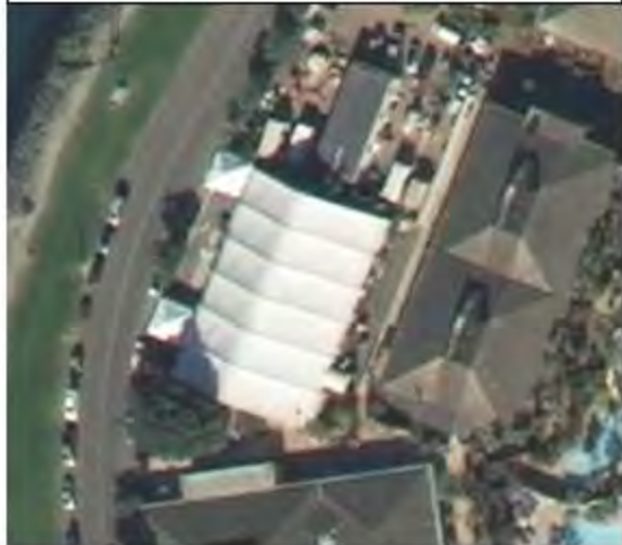
Jan. 2008 (unpermitted tents)