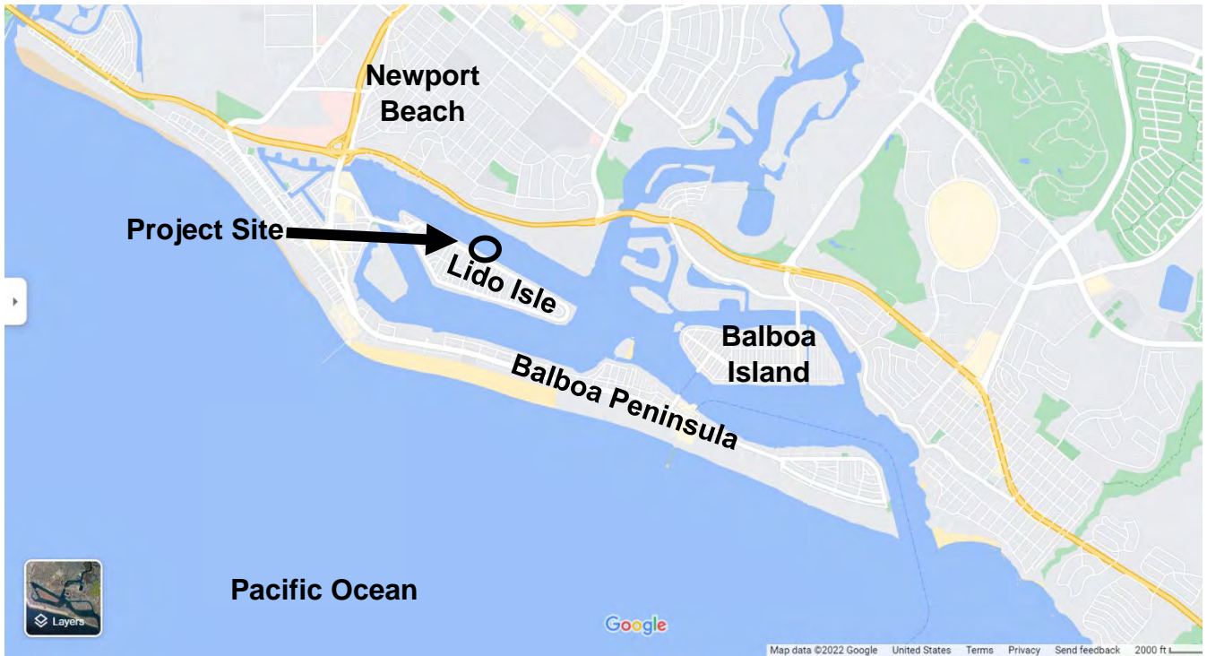
Exhibit 1—Vicinity Map