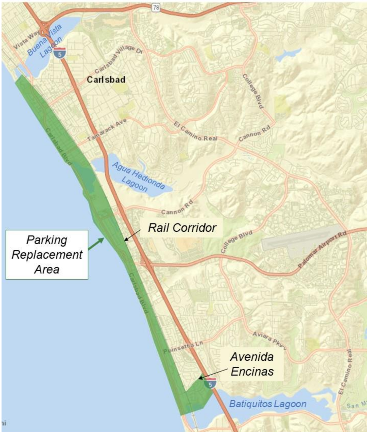
EXHIBIT NO. 4