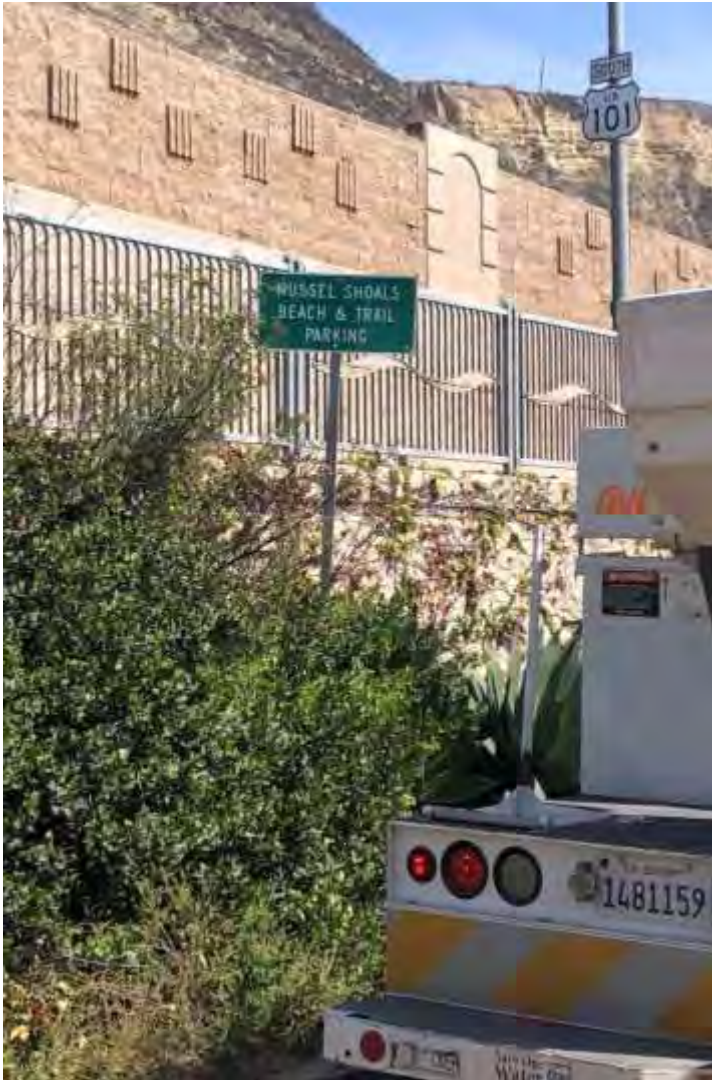
Photo of sign that was erected on September 29, 2021 (photo taken same day)