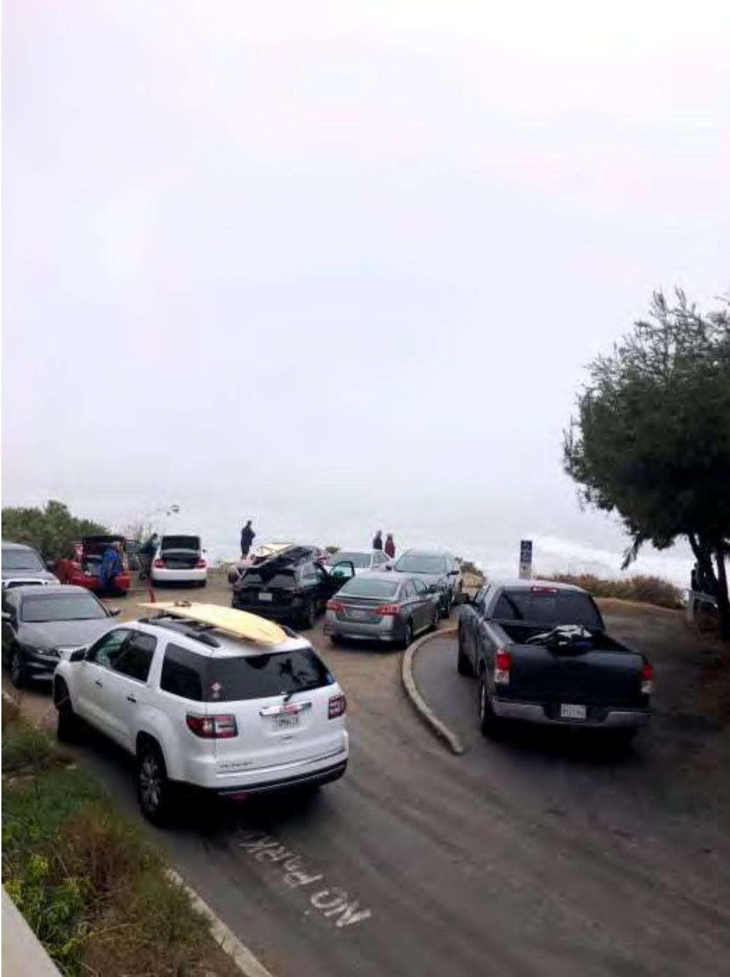
Photo of stacked parking at the Cliff House Inn cul-de-sac (November 3, 2021)