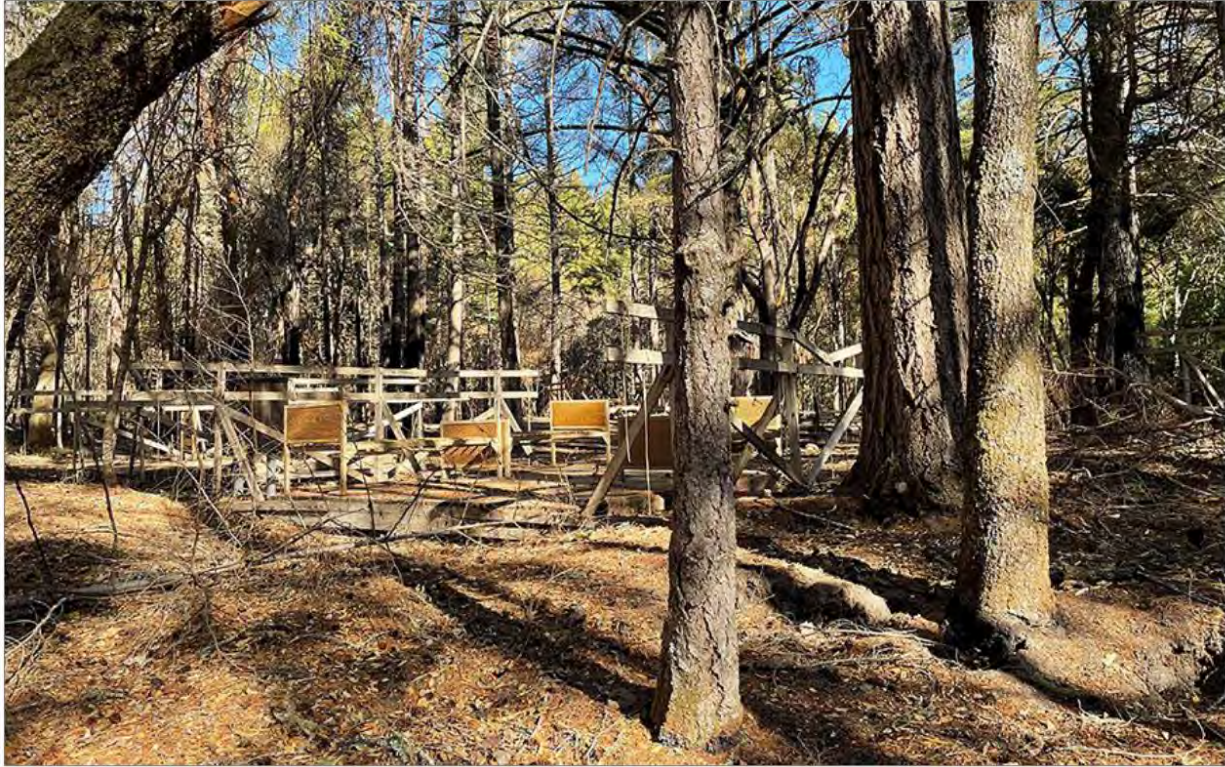
EXHIBIT 3 - Site Photos