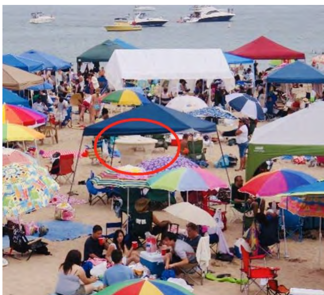
Newport Beach staff explained why trash collection can only be done early in the morning.

The four photos below show you why these requirements are necessary.